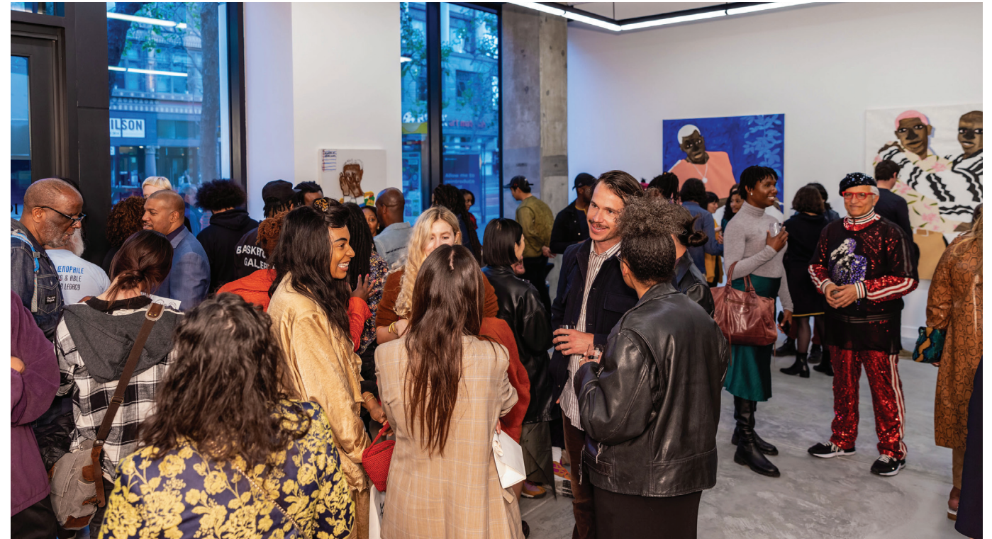
Jonathan Carver Moore Gallery (above) and Fermentation Lab (below)

IKEA NOW OPEN The much anticipated IKEA is complete with a food hall and on-site indoor parking. The new coworking space will open next year.