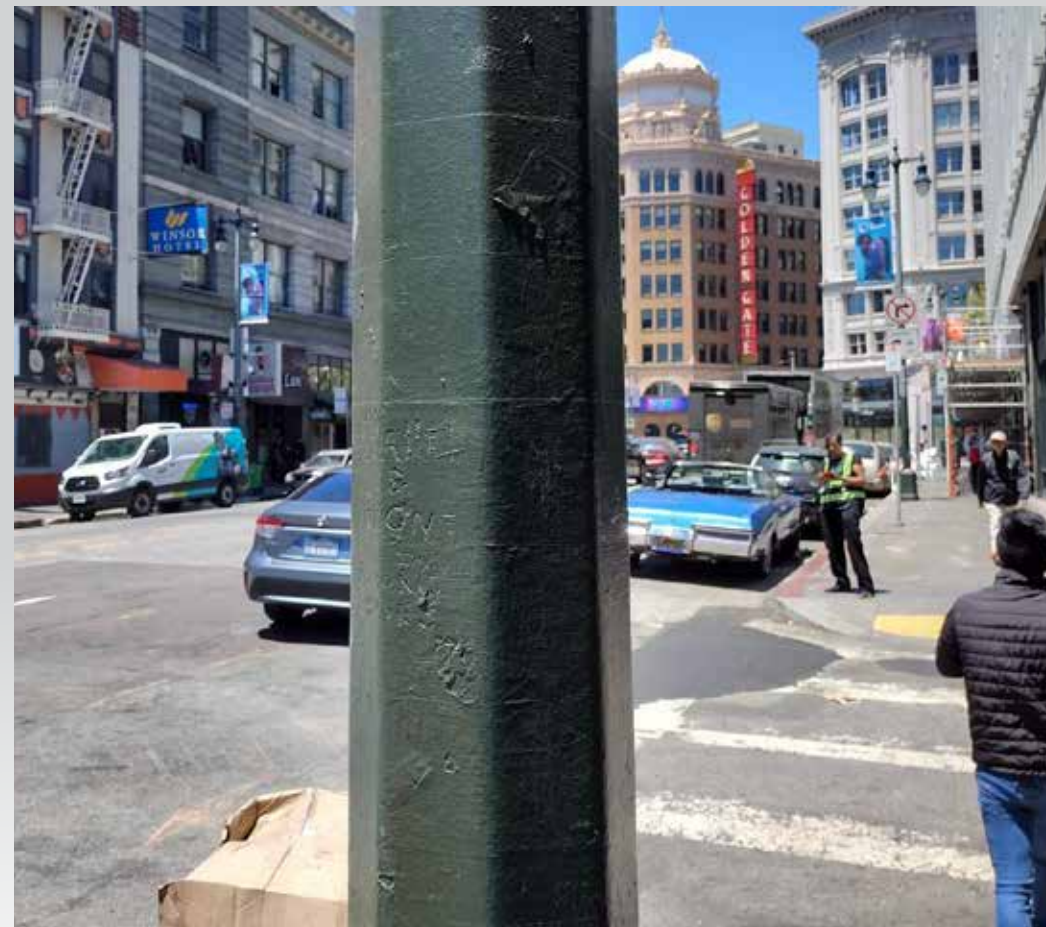
Flyer removed 6th & Stevenson Street