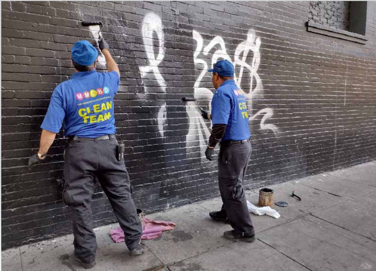
Graffiti removed 34 7th Street (Stevenson St Side)