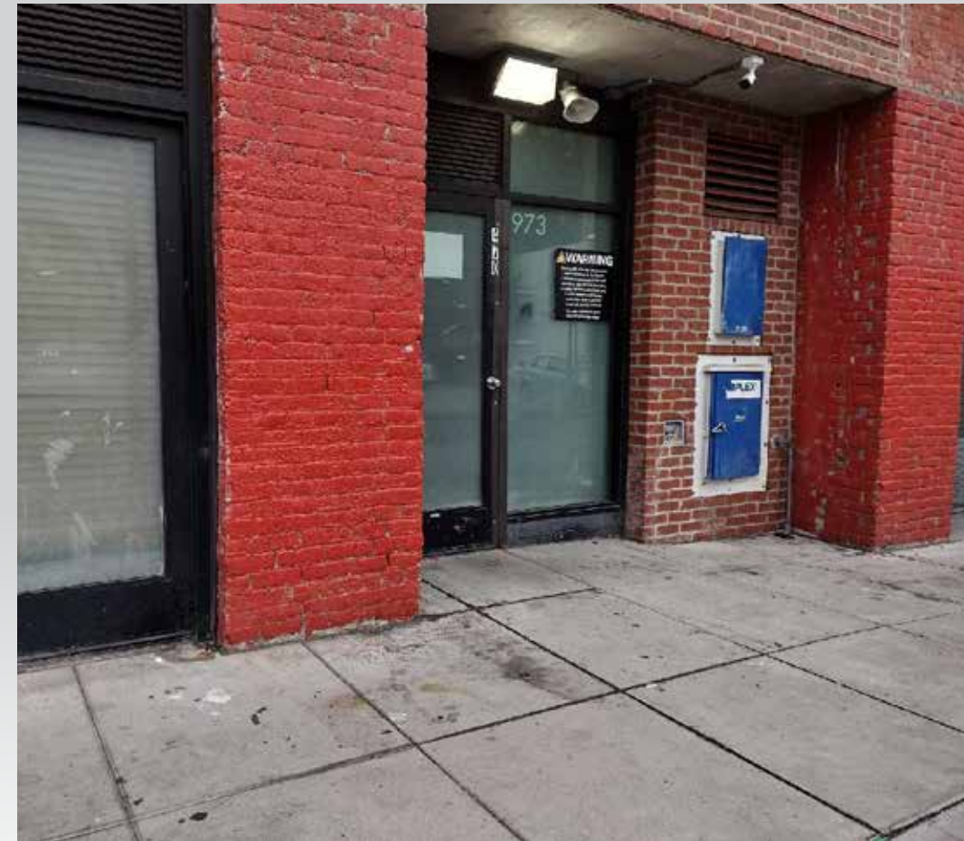
Trash removed 470 Stevenson Street