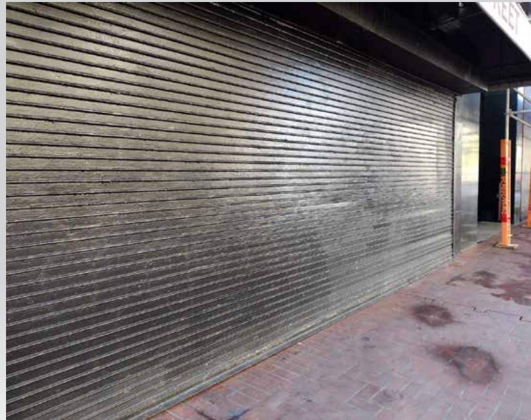
Graffiti removed 991 Market Street