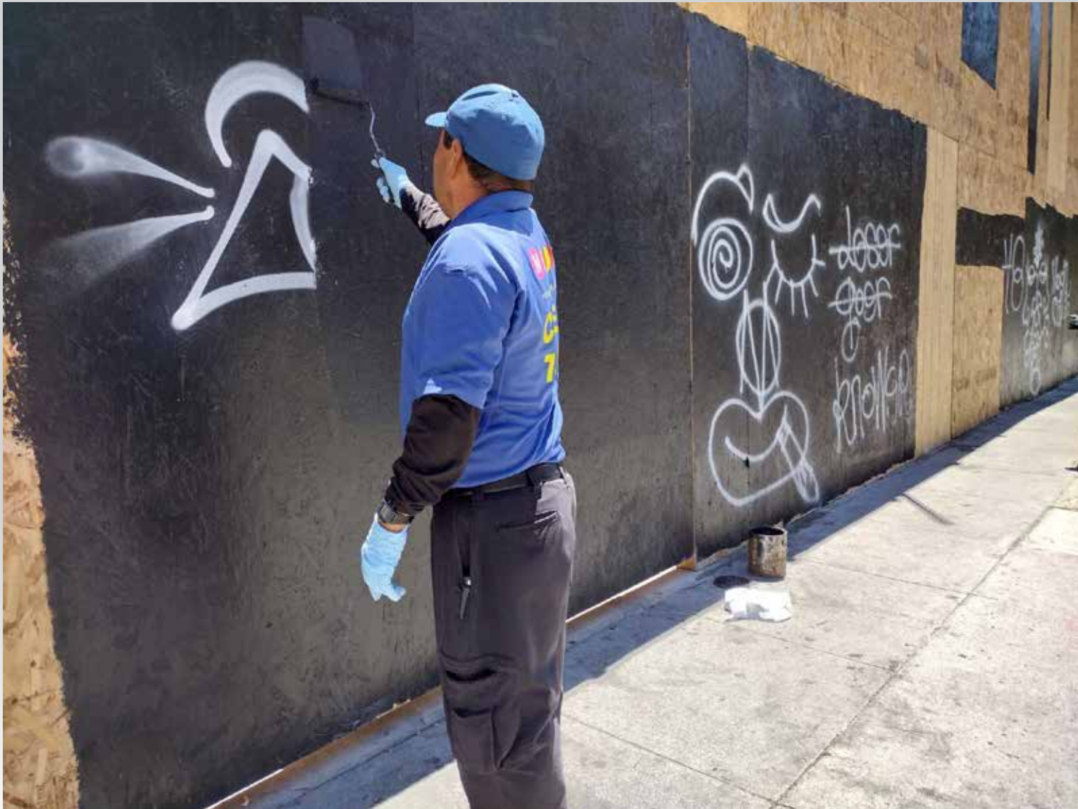
Graffiti removed 1014 Mission Street