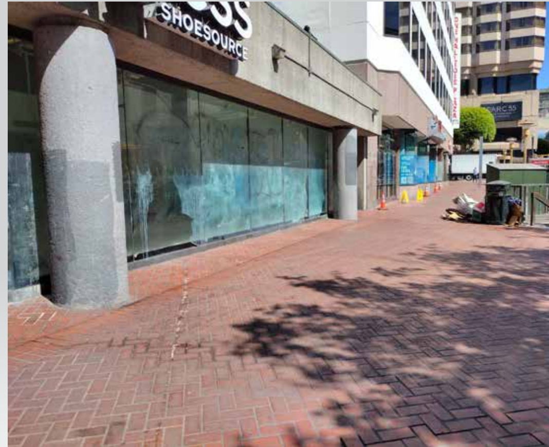
Trash removed 934 Market Street