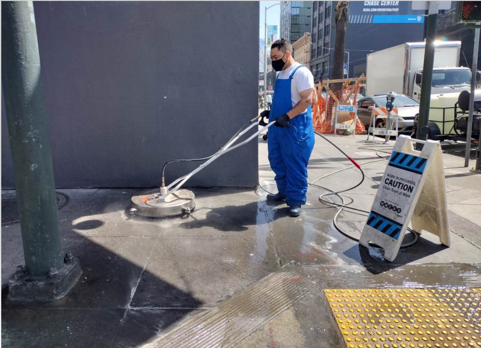
Pressure washing 1000 Mission St