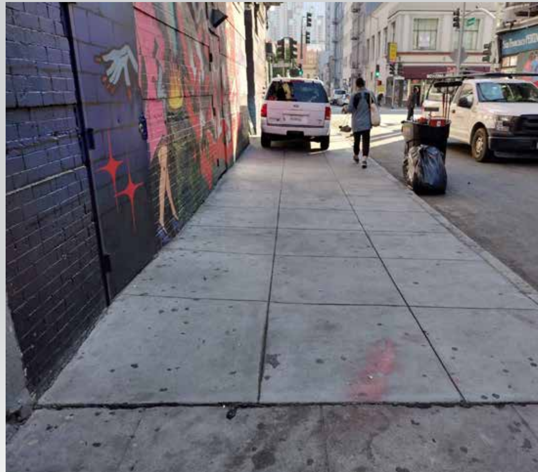
Trash removed 500 block of Jessie Street