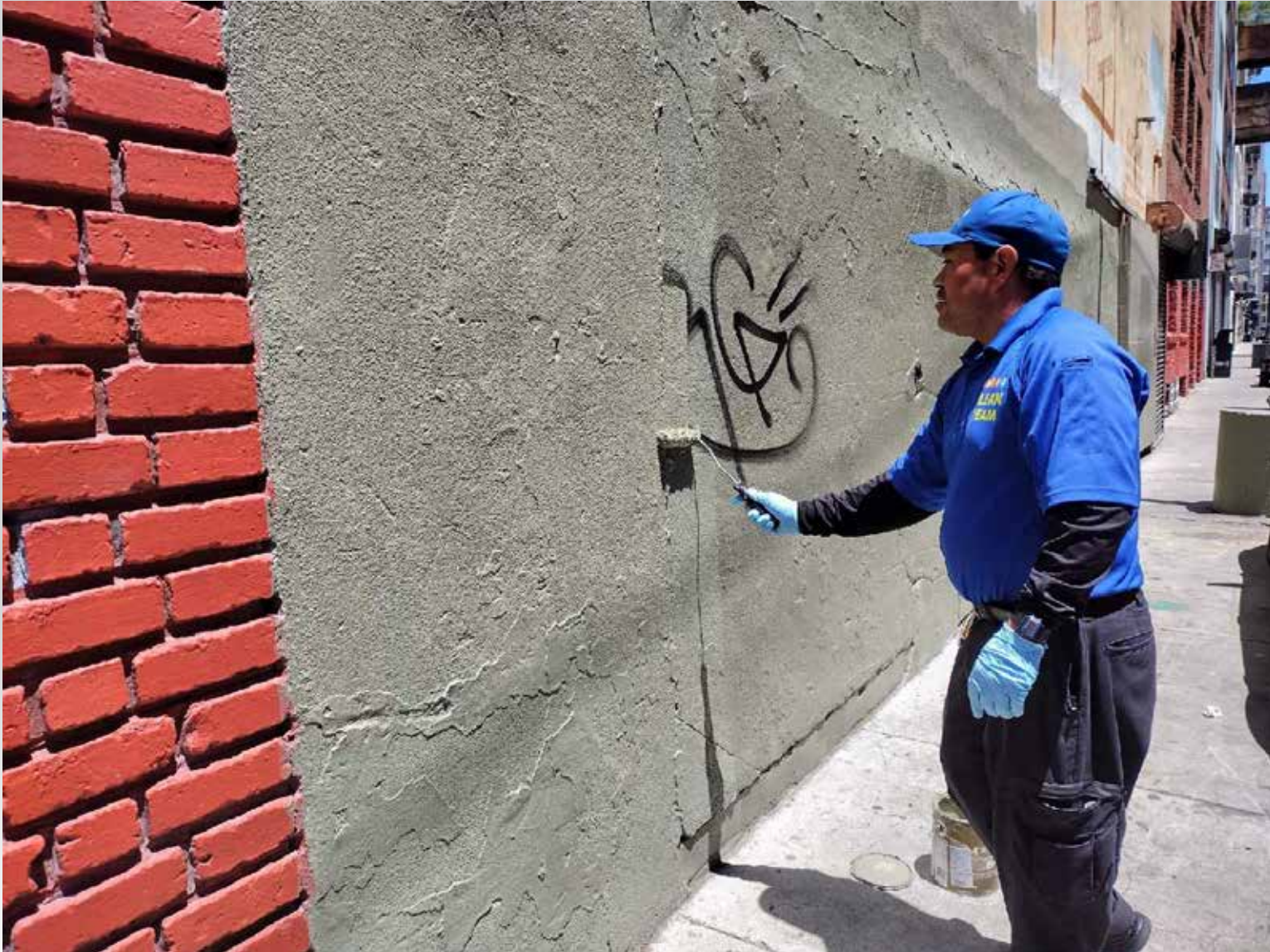
Graffiti removed 556 Stevenson Street