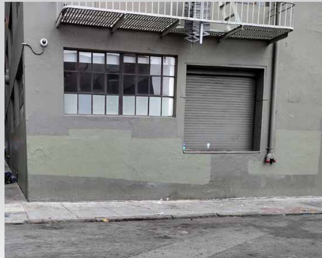
Homeless assisted Individual was referred to St. Anthony's church upon request. 1161 Mission Street (Minna Side)