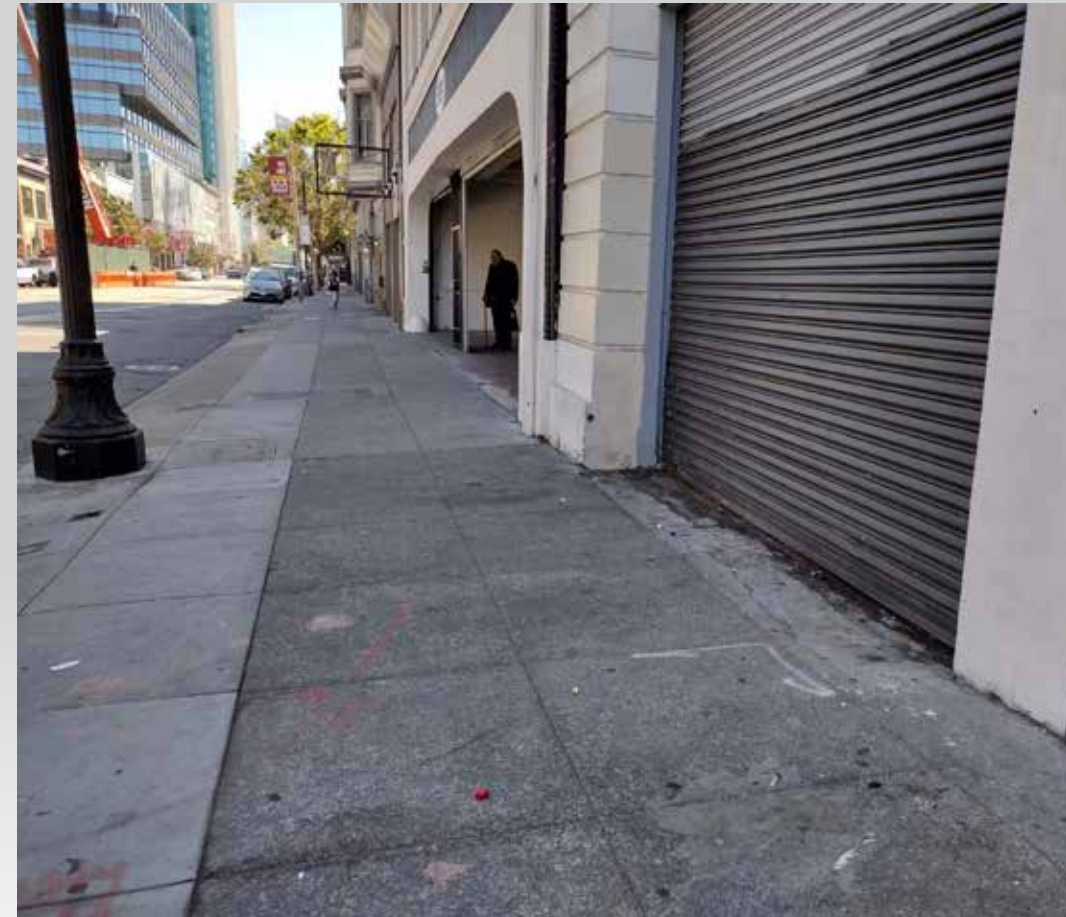
Homeless assisted Individual was escorted to the Hospitality House upon request. 993 Howard Street