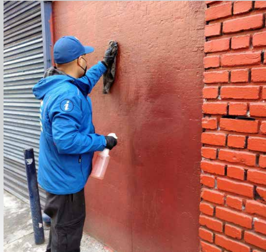
Graffiti removed 560 Stevenson Street