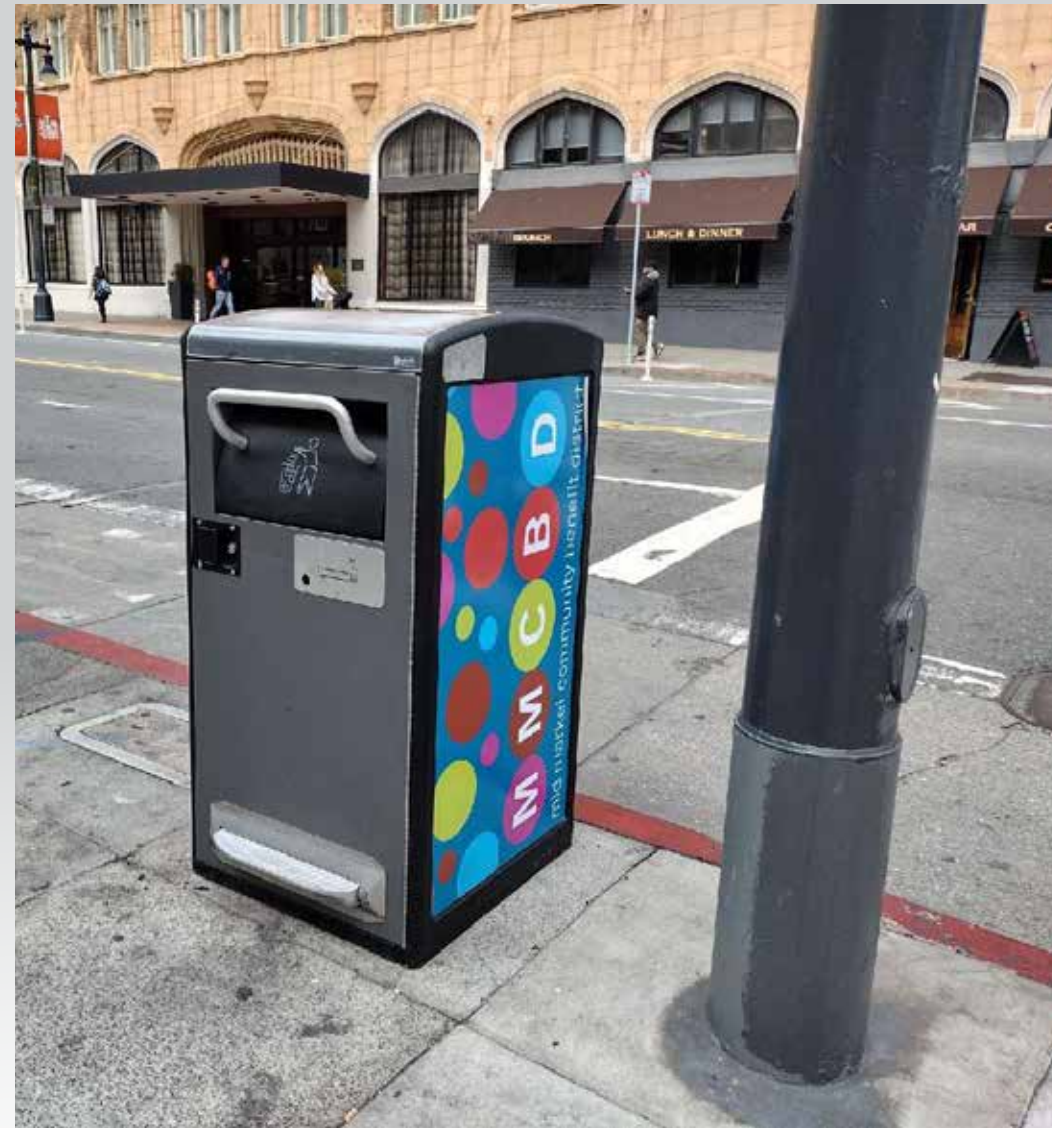
Sanitation 99 5th Street