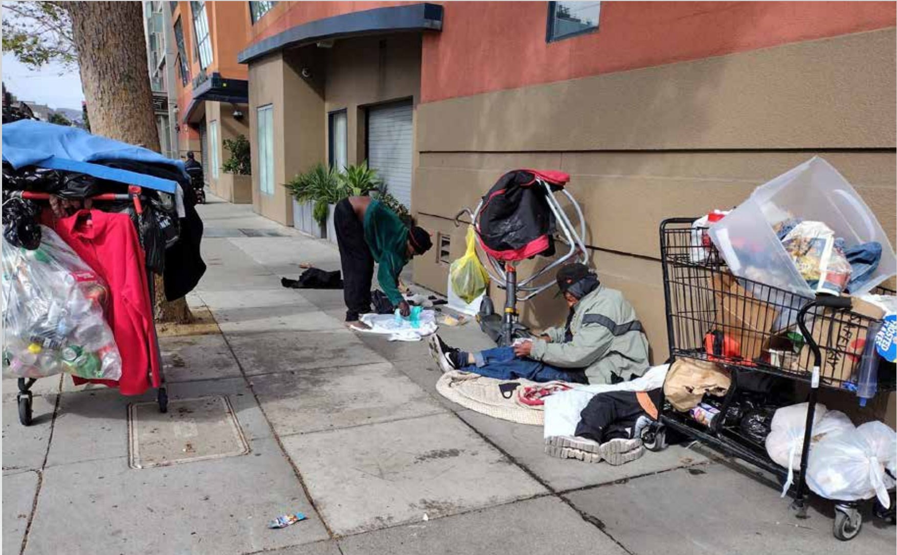
Homeless Assisted Three individuals escorted to the Linkage Center upon request. 980 Howard Street