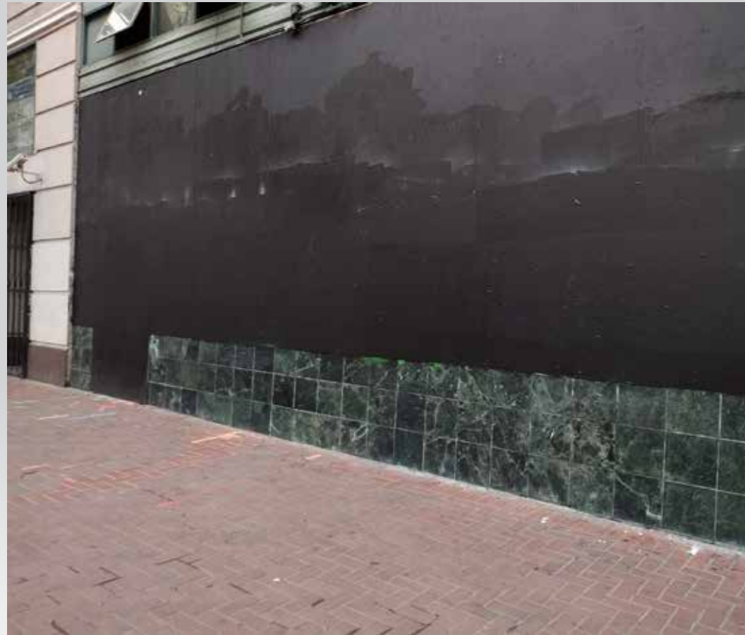
Graffiti removed 1200 Market Street