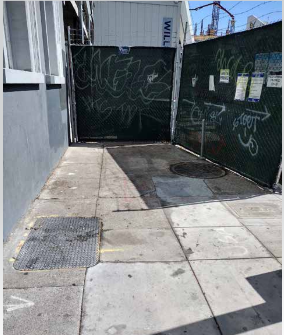
Homeless Assisted Individual was escorted to the Hospitality House upon request. 964 Howard Street