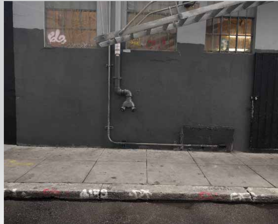
Graffiti removed 620 Stevenson Street