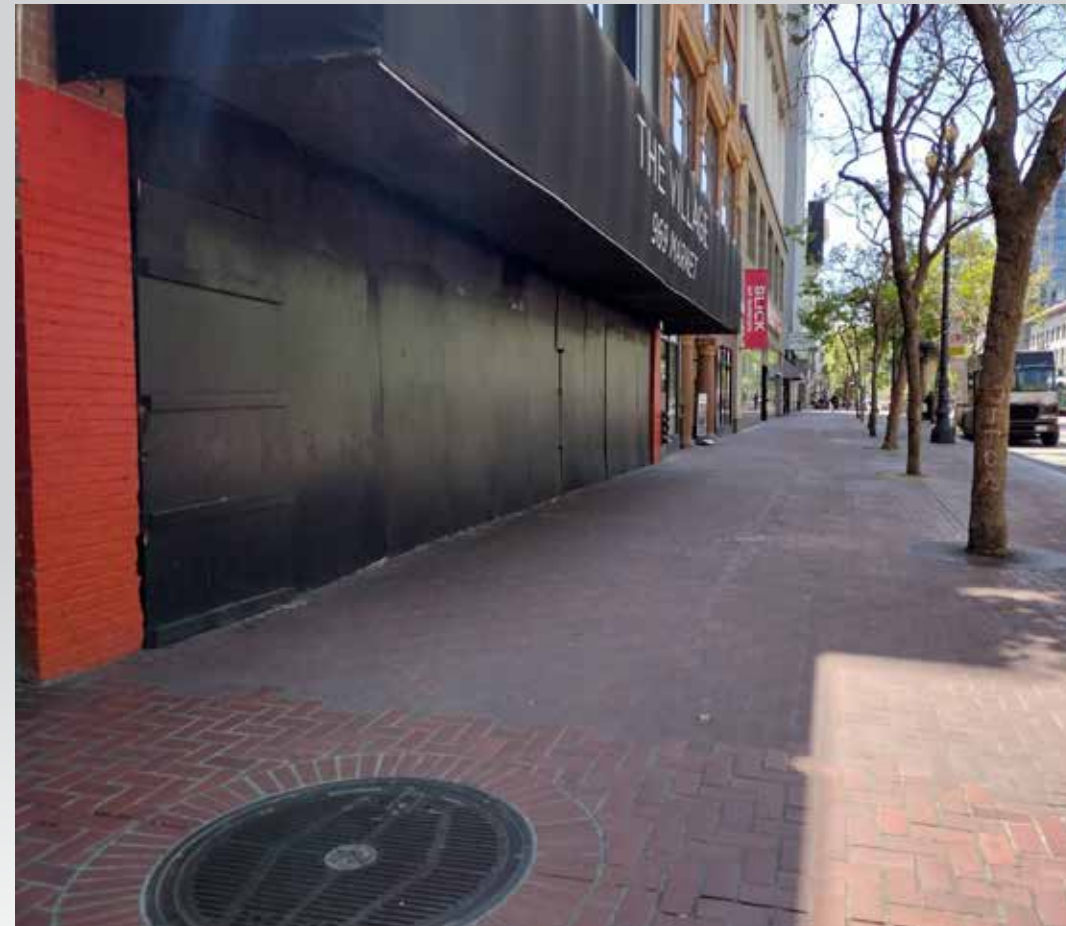
Homeless Assisted Three individuals escorted to St. Anthony's upon request. 969 Market Street