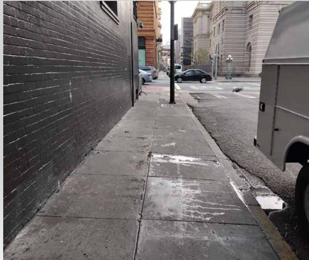
Trash removed 600-Block of Stevenson Street