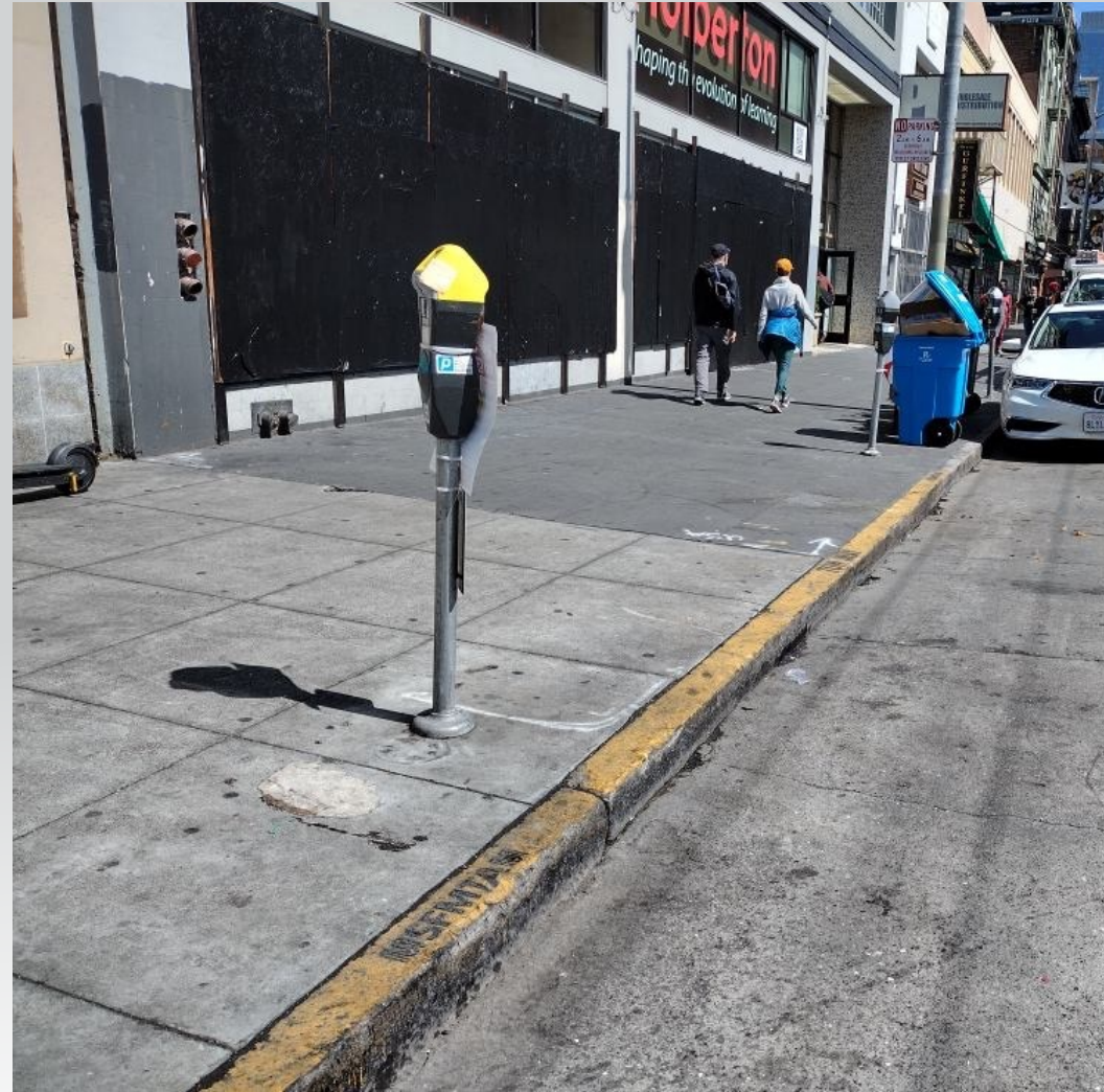
Trash removed 982 Mission Street