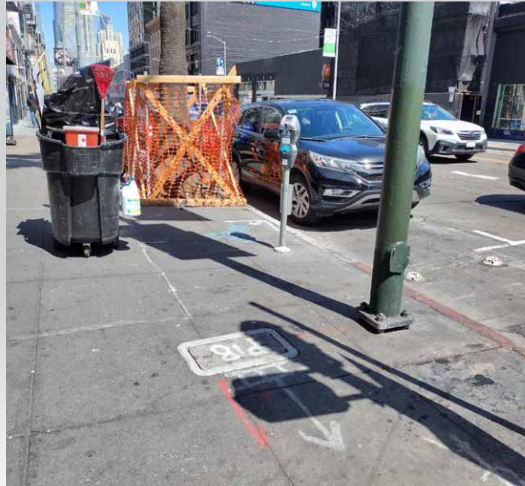
Trash removed 996 Mission Street