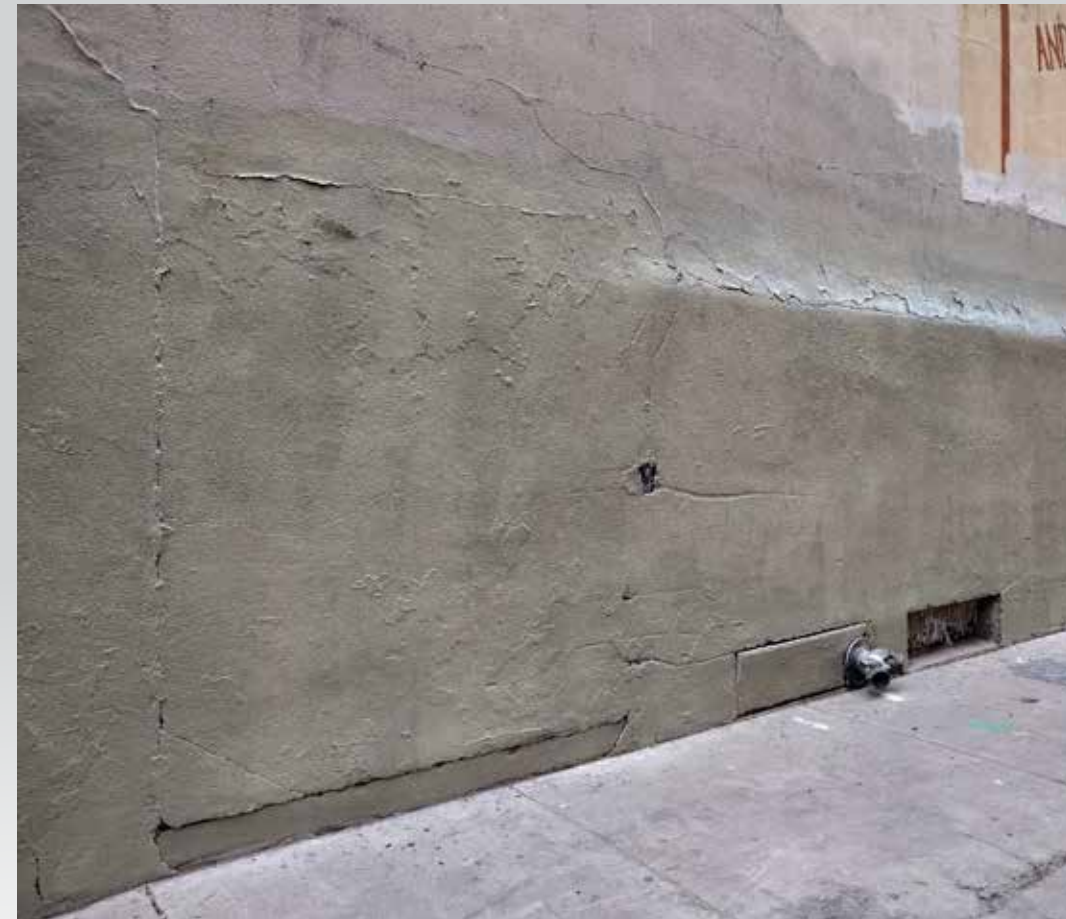
Graffiti removed 556 Stevenson Street