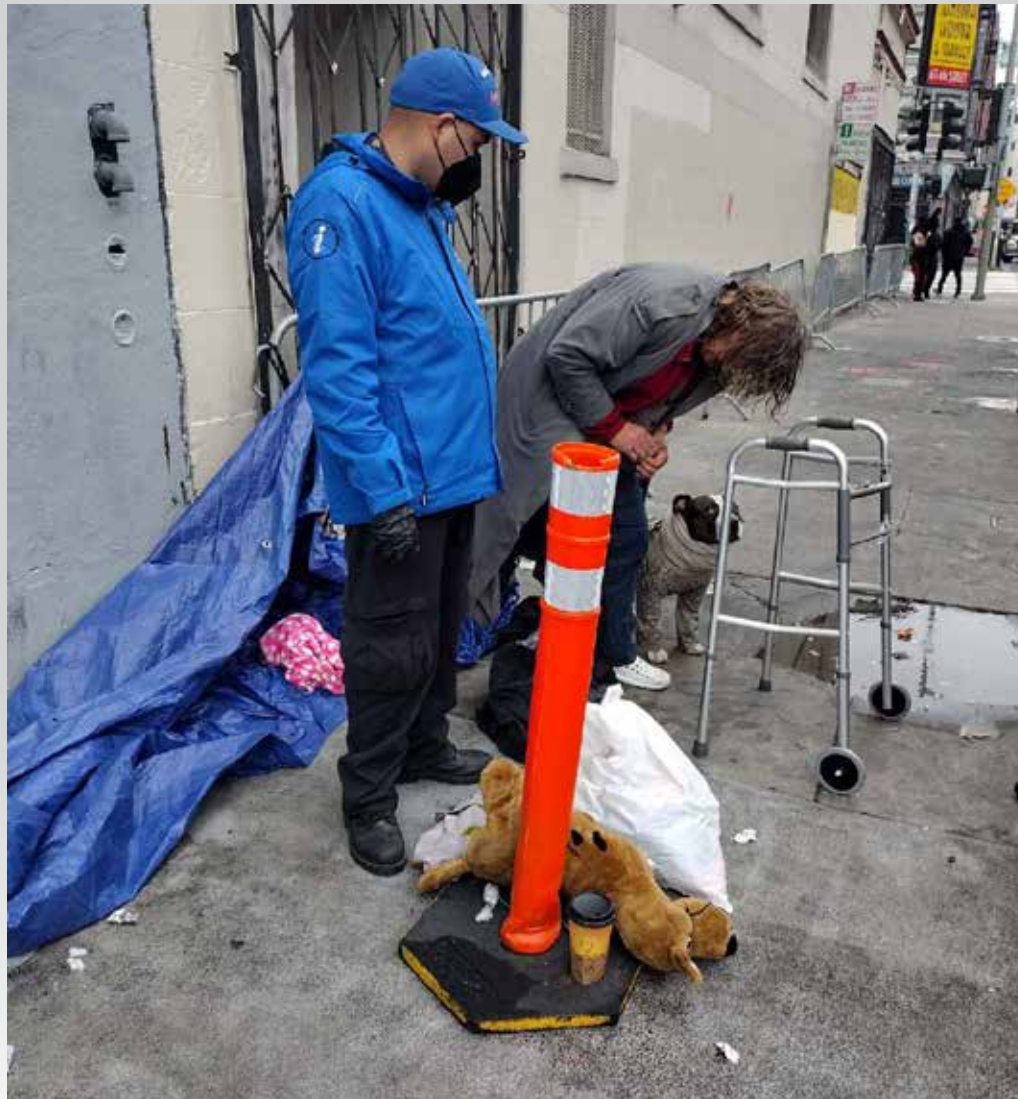
Homeless assisted Individual escorted to the Linkage Center upon request. 481 Jesse Street