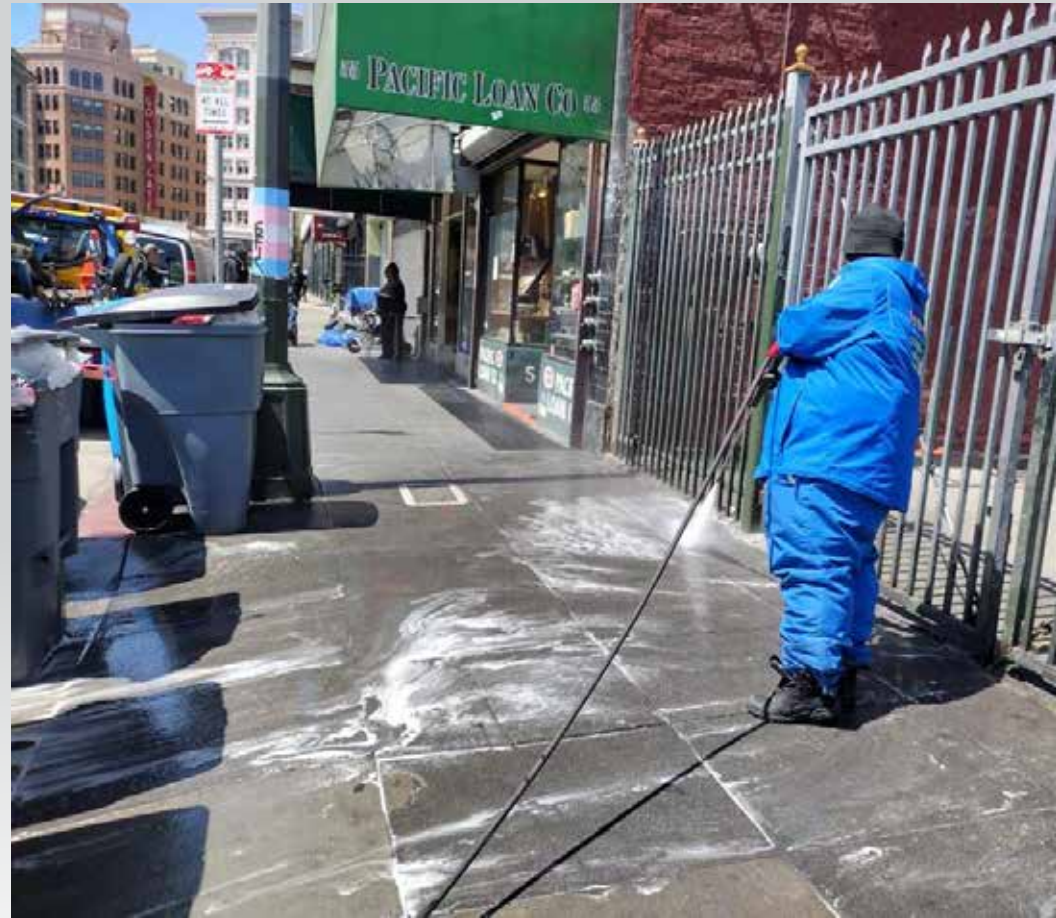
Pressure washing 55 6th Street