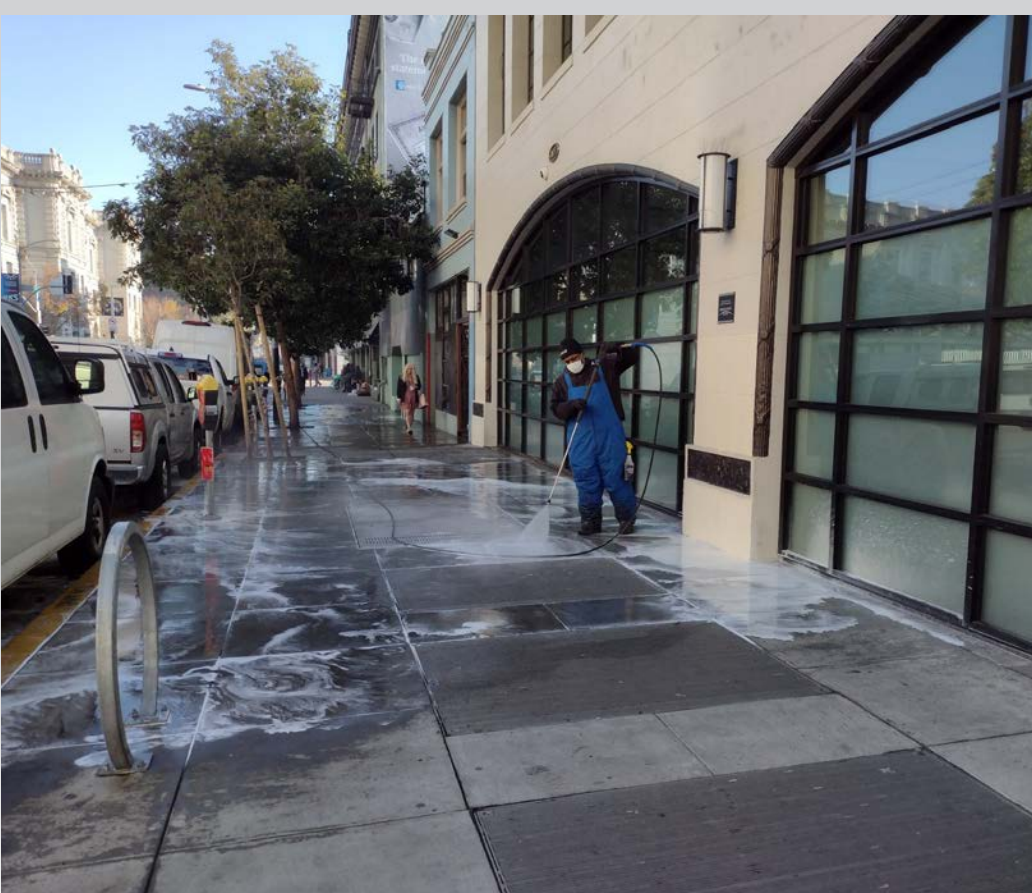
Pressure washing - 1127 Mission Street