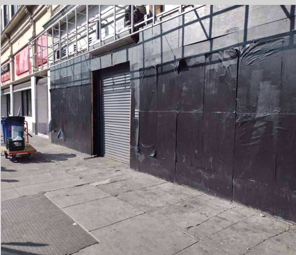
Graffiti removal - 1024 Mission Street