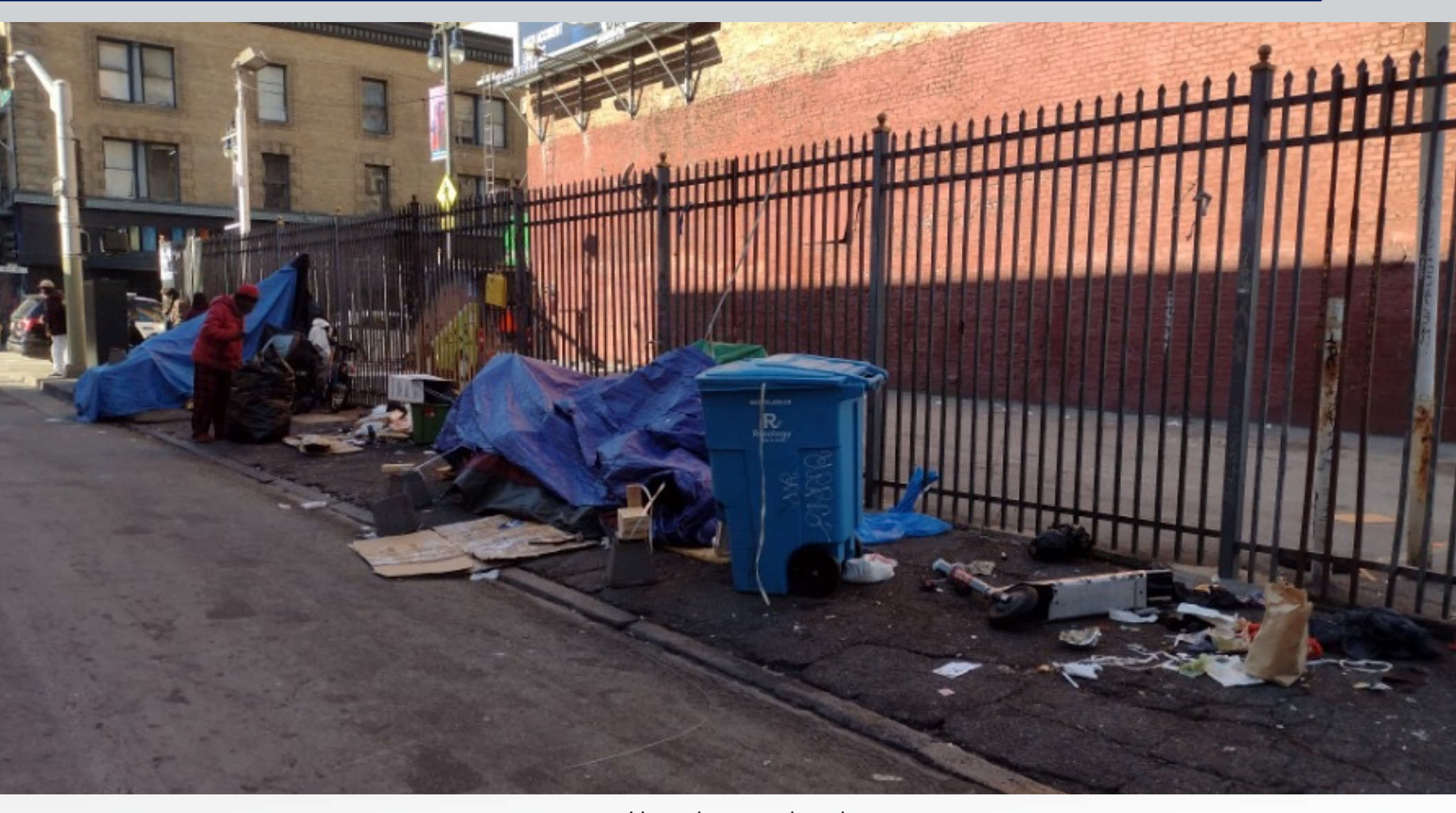
Homeless assisted These five individuals were escorted to Hospitality House upon request. 400 Block Jesse Street