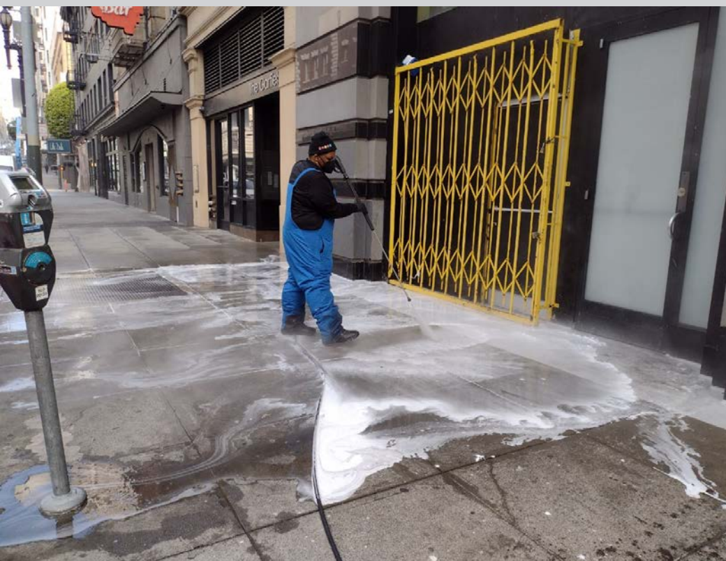
Pressure washing - 30 Mason Street