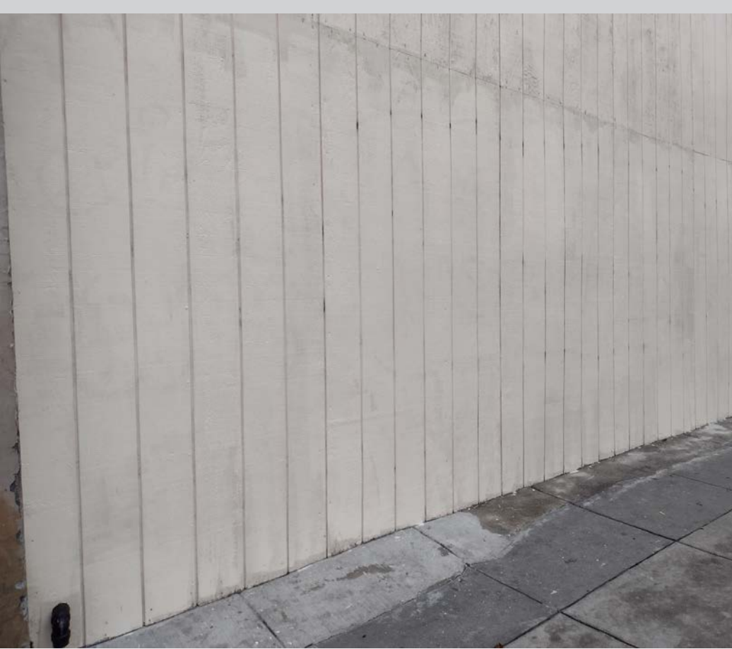
Graffiti removal -160 6th Street