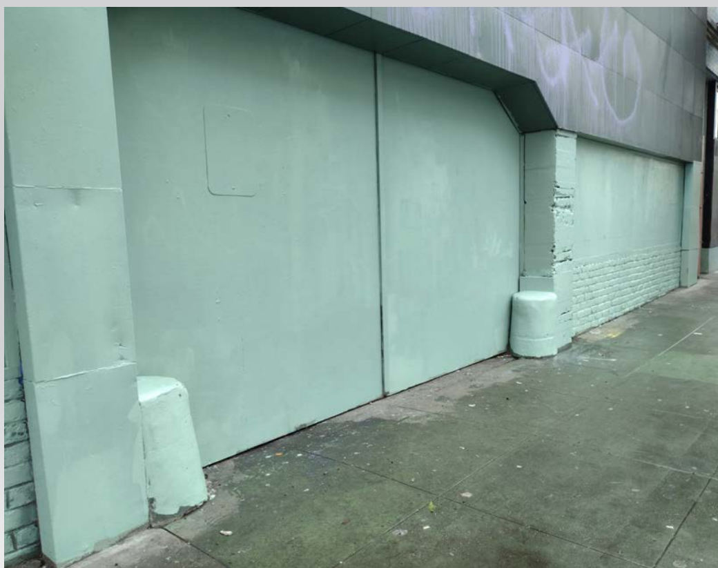
Graffiti removal - 1111 Mission Street (Given permission to use this color paint.)