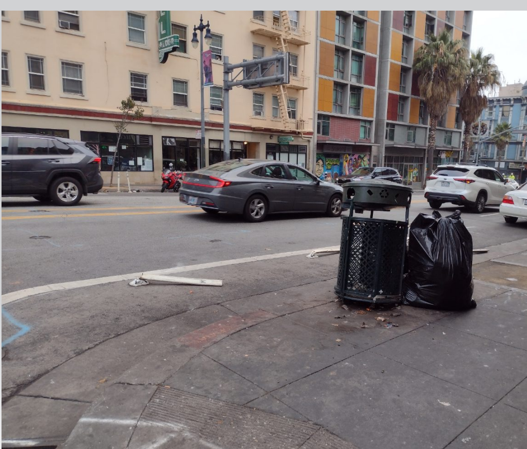
Trash removal - 164 6th Street