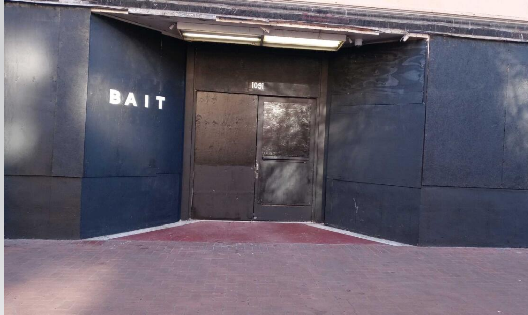
Homeless assisted This individual was escorted to the Linkage Center upon request. 1091 Market Street