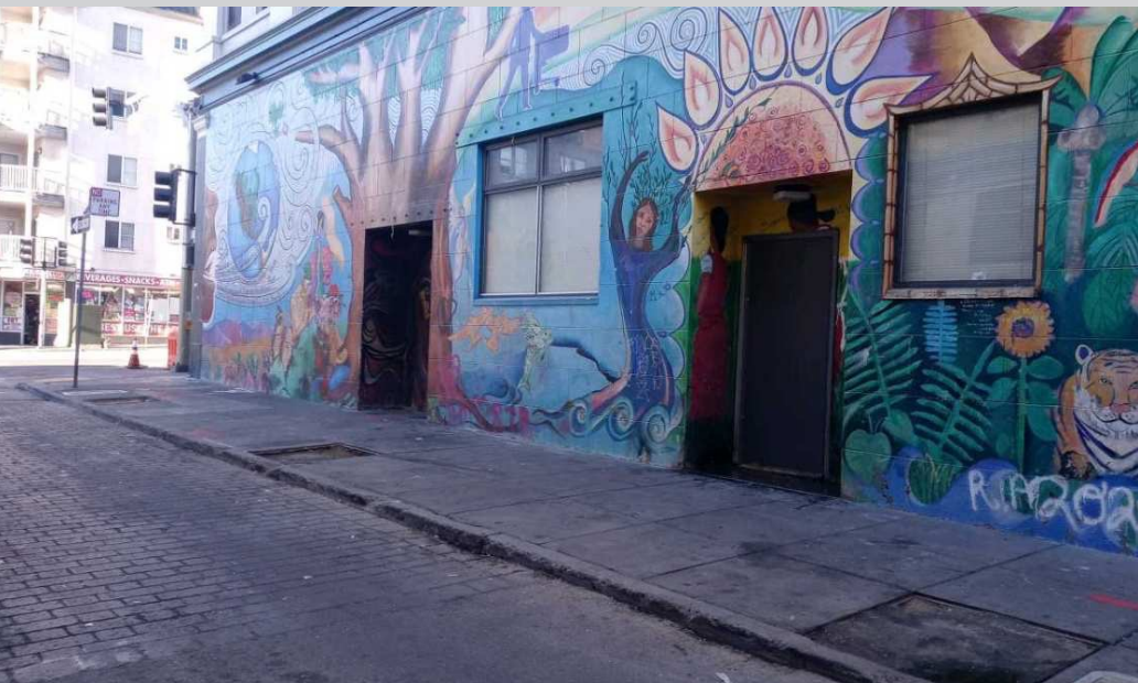
Trash removal - 400 Block Minna