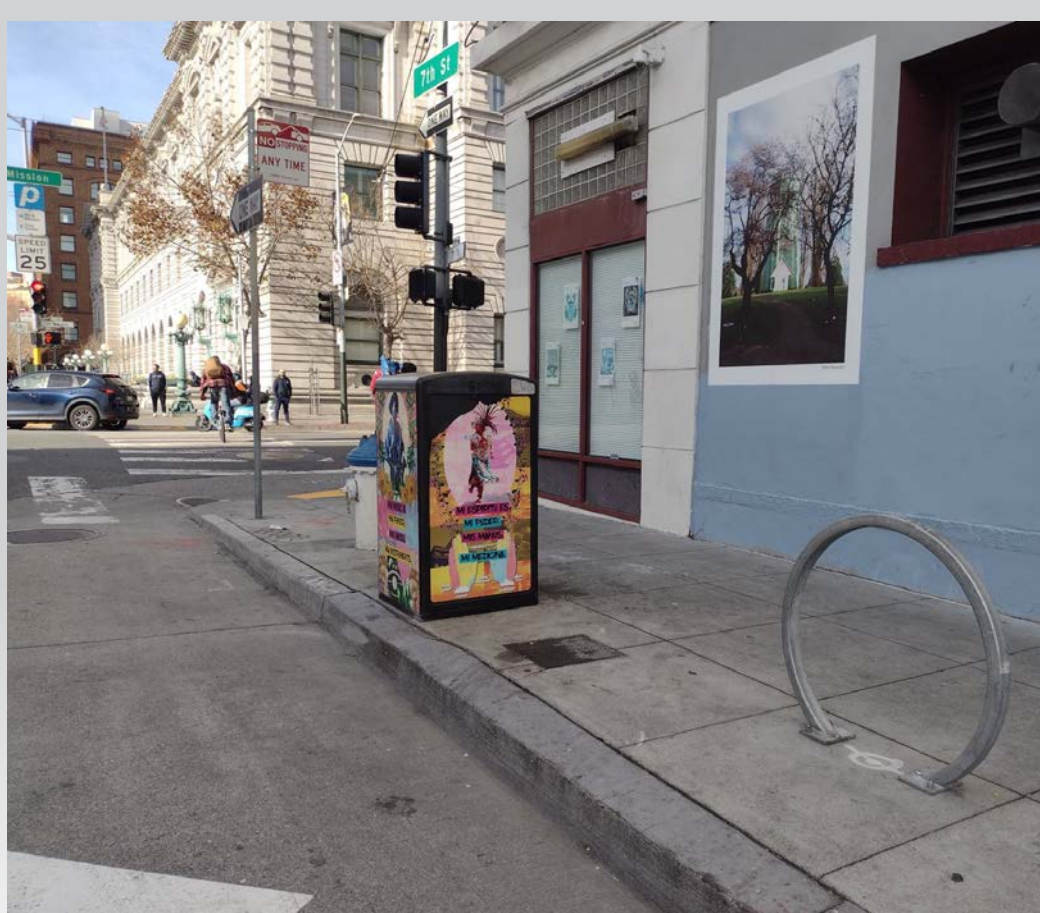
Trash removal - 1100 Mission Street