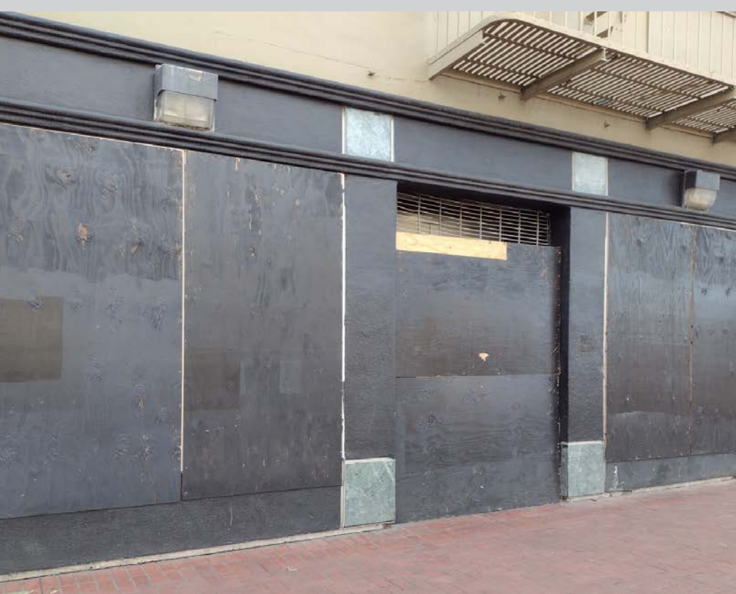
Graffiti removal - 1113 Market Street