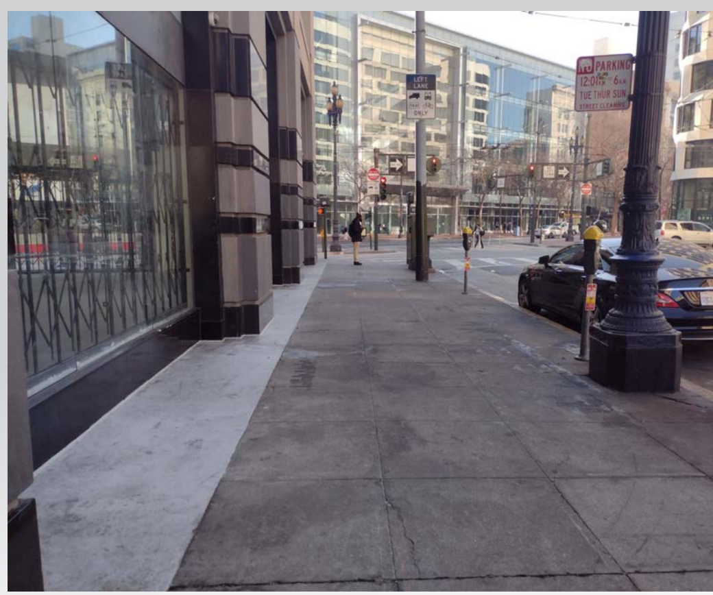
Homeless assisted This individual was escorted to St. Anthony's upon request. 30 Mason Street