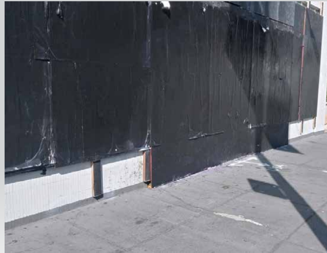
Graffiti removed 972 Mission Street