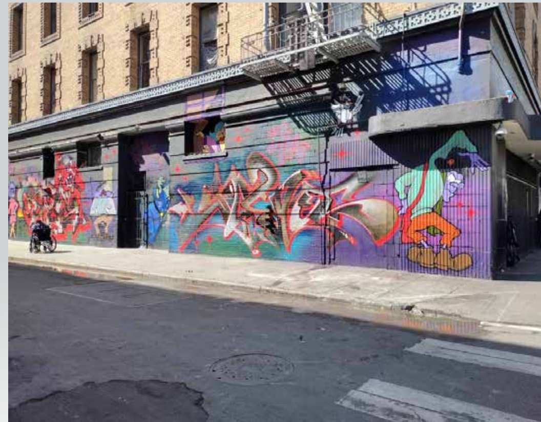
Homeless assisted This individual was escorted to the Hospitality House upon request. 500-block of Jessie Street