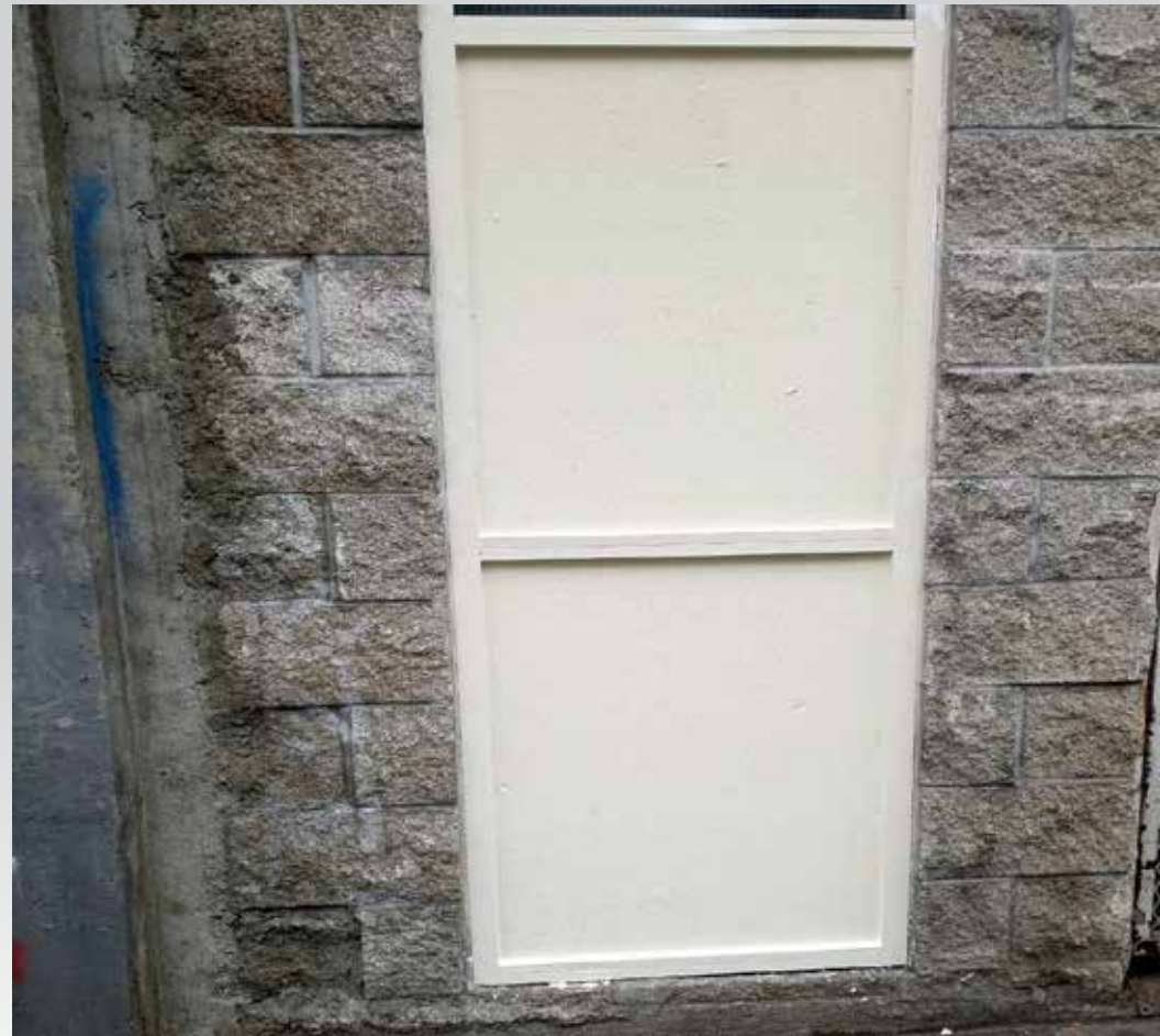
Graffiti removed 518 Minna Street