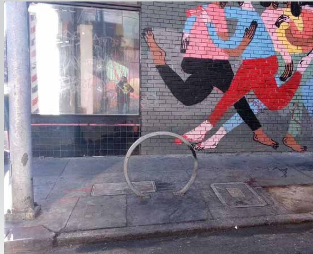
Trash removed 500-Block of Jessie Street