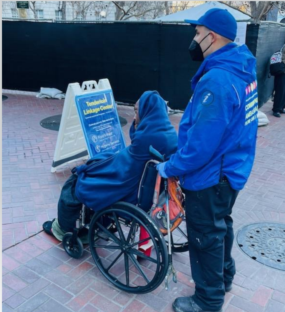
Homeless assisted This individual was escorted to Tenderloin Linkage Center