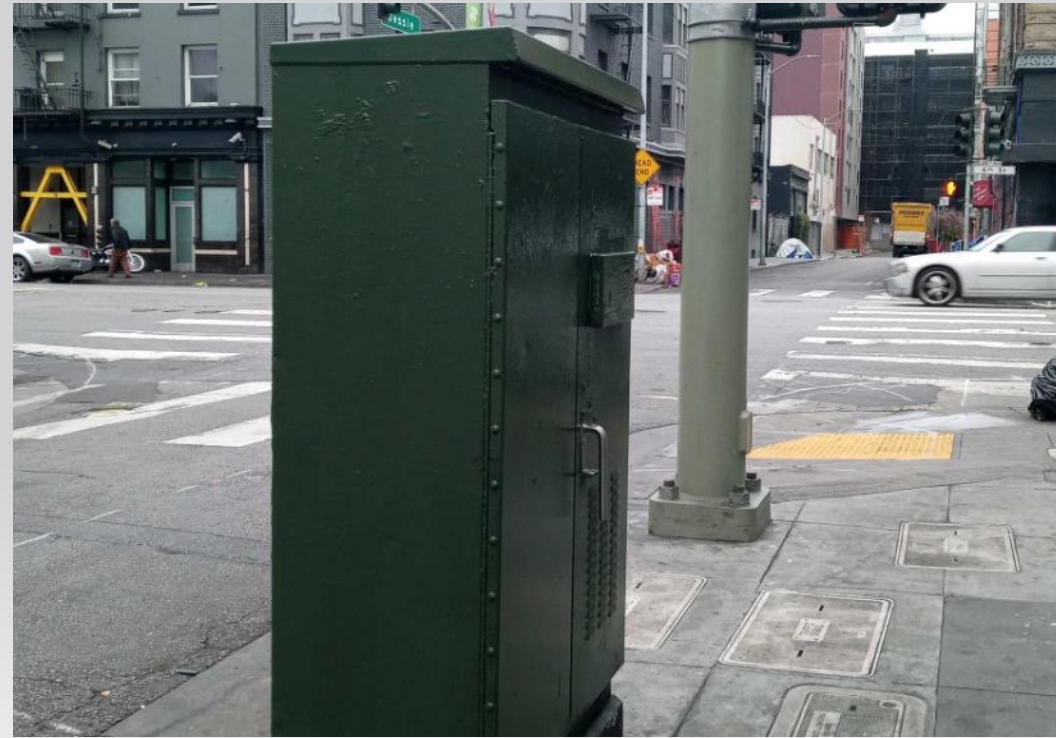
Graffiti removed 400-Block of Jessie Street