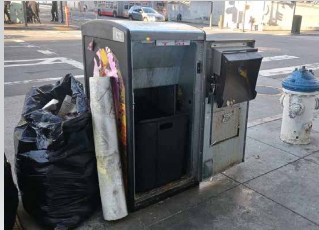
Trash removed 105 7th Street