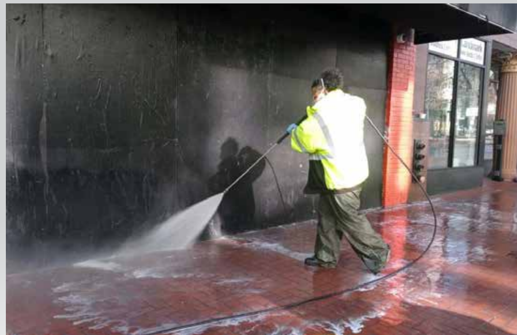
Pressure Wash 945-969 Market Street