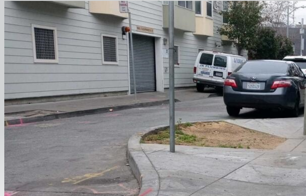
Trash removed 532 Minna Street