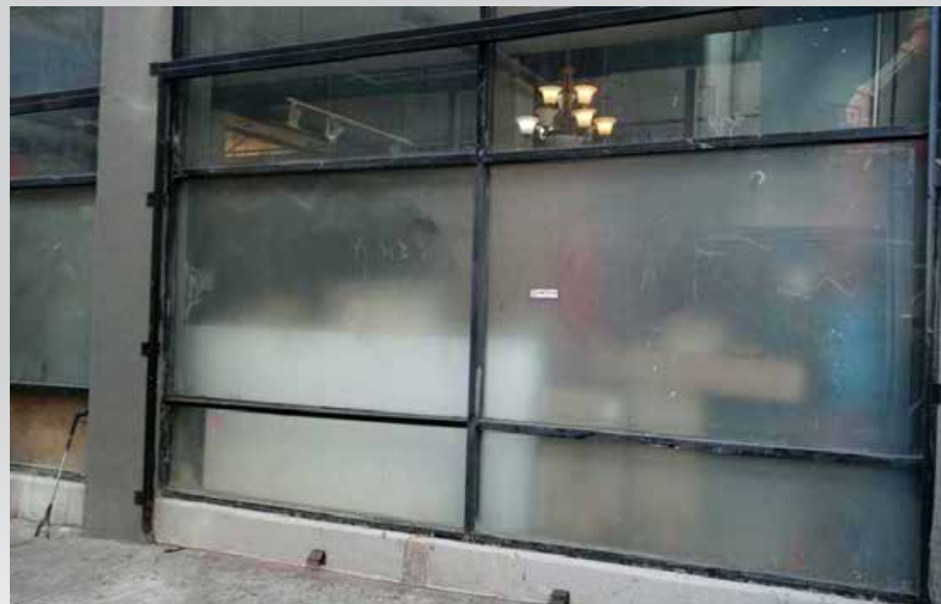
Graffiti removed 1167 Mission Street