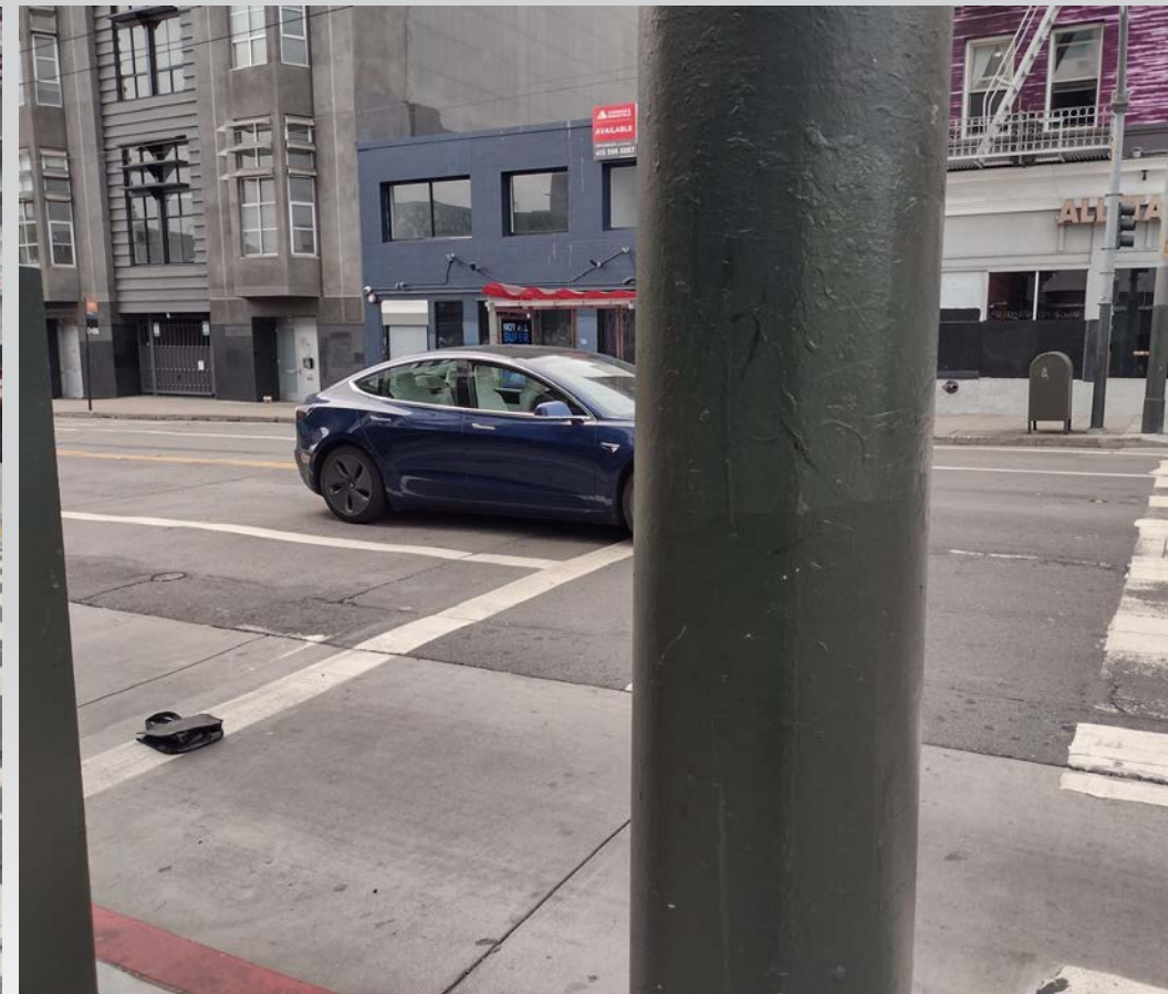
Flyer removal – 1300 Mission Street