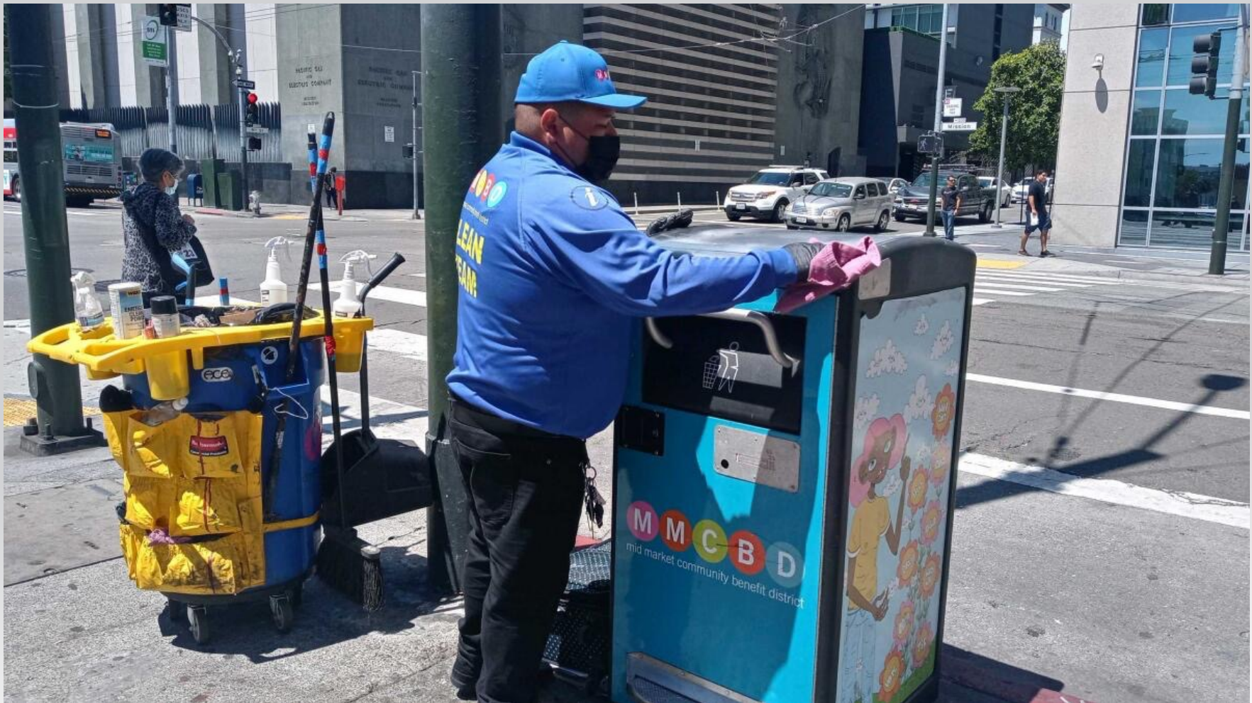
Sanitation – 1200 Mission Street