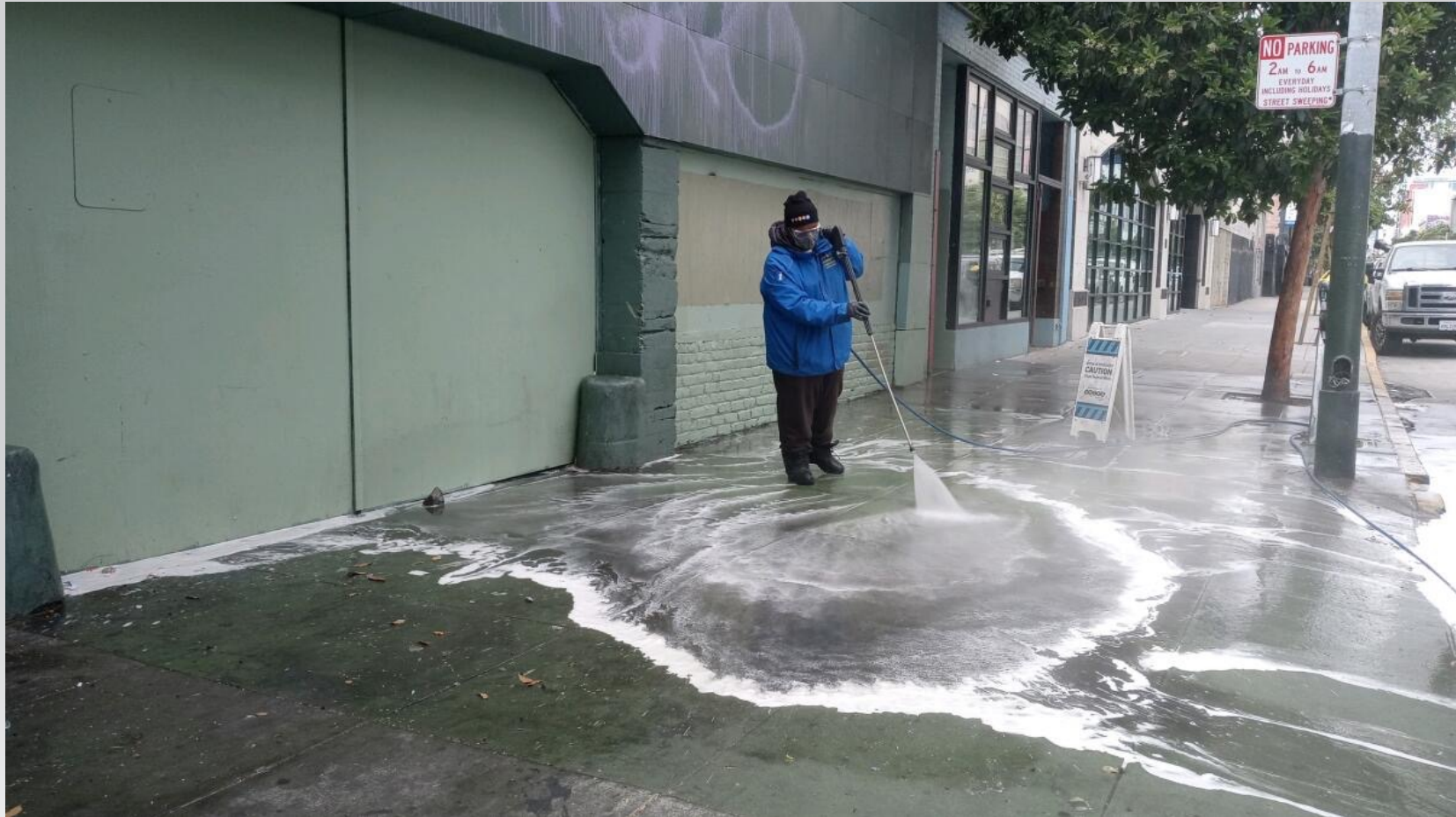
Pressure washing - 1121 Mission Street