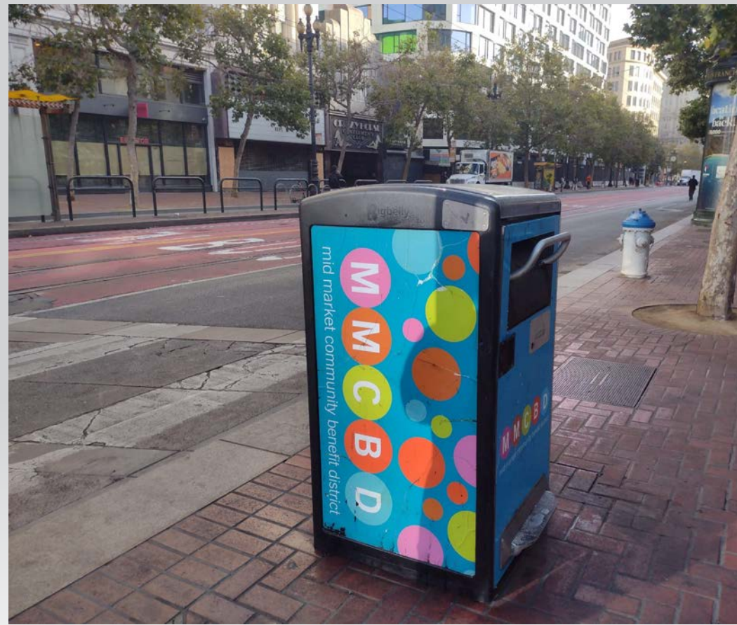
Graffiti removed – 989 Market Street