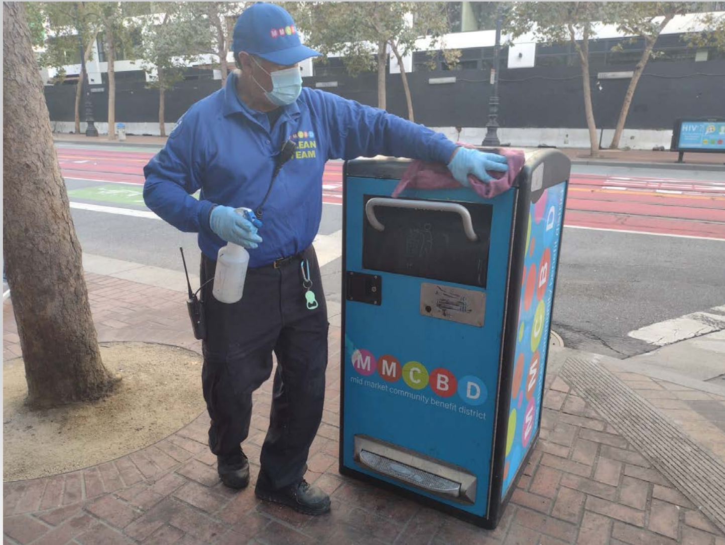
Sanitation – 945 Market Street