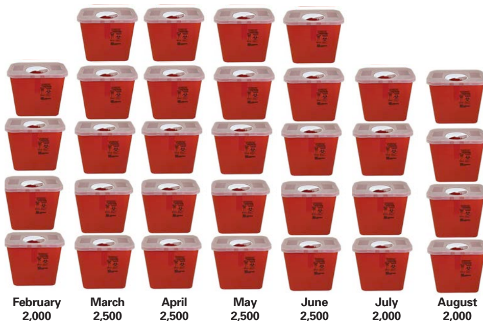
FEBRUARY - AUGUST 2021 NEEDLES COLLECTED FROM DISTRICT SIDEWALKS & PLAZAS (500 NEEDLES/BOX)