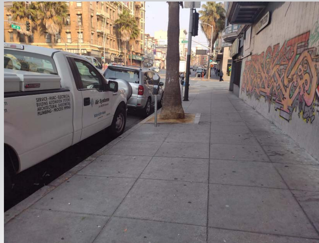
Trash removed – 219 6th Street