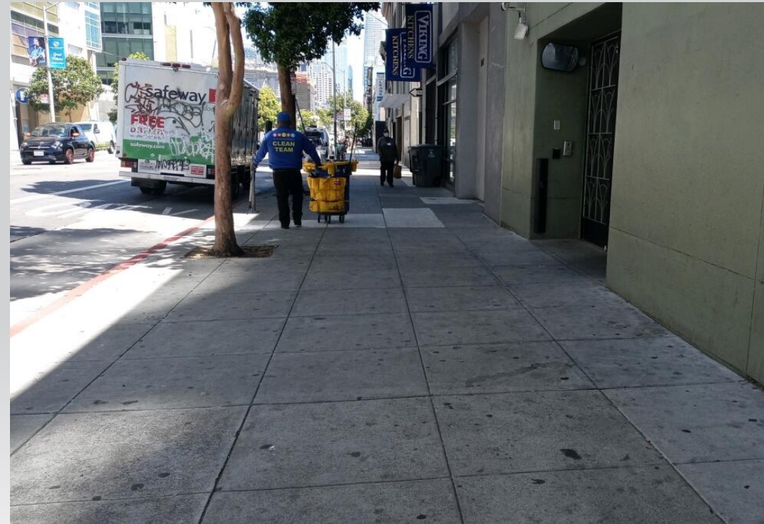
Trash removed – 1171 Mission Street