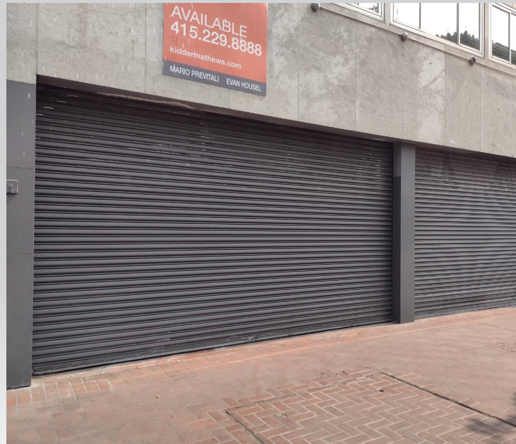
Graffiti removed – 1061 Market Street