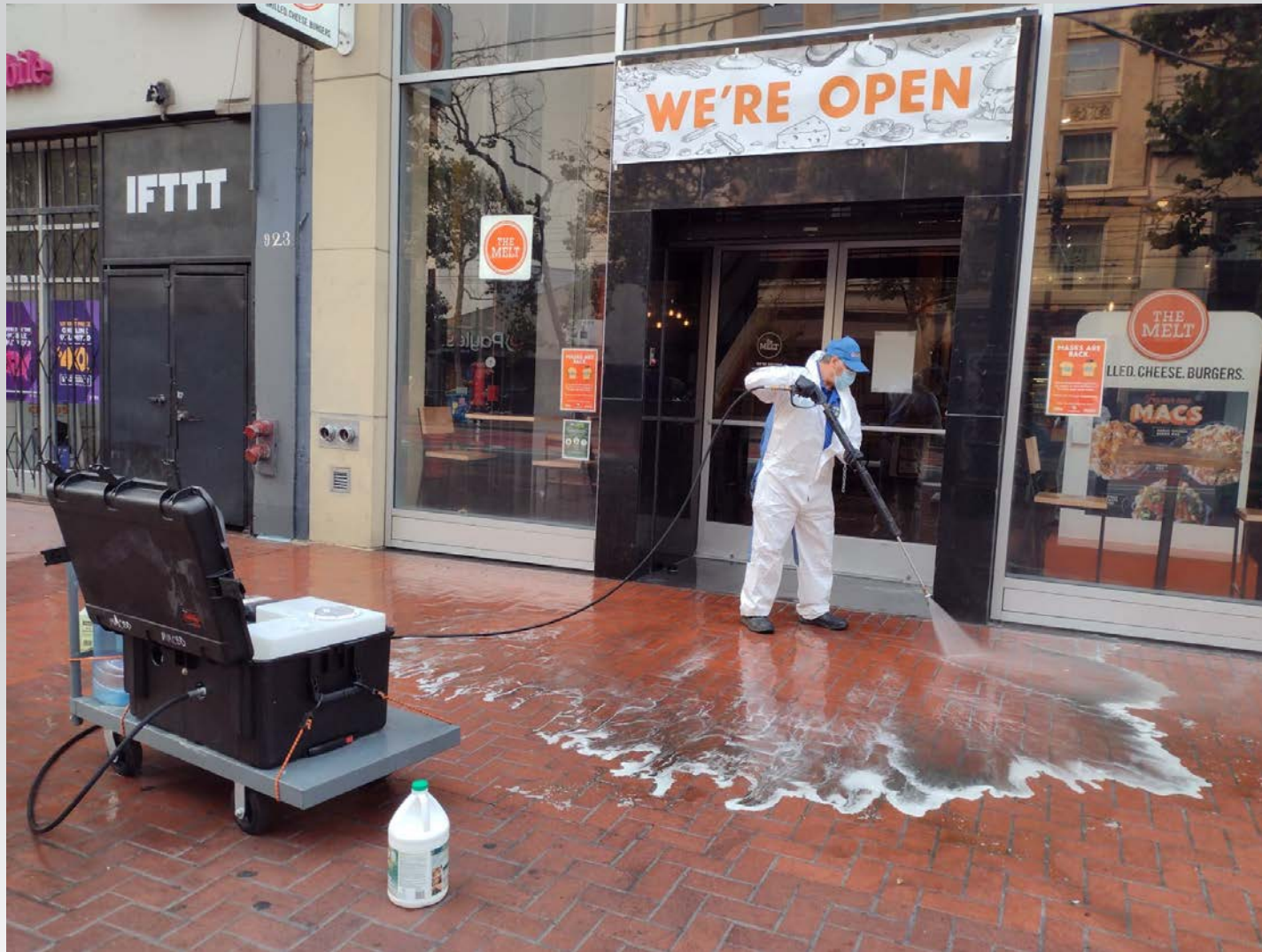
Pressure washing – 925-929 Market Street