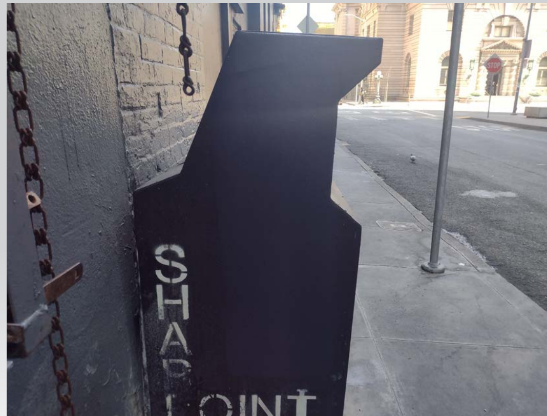
Graffiti removed – 620 Stevenson Street