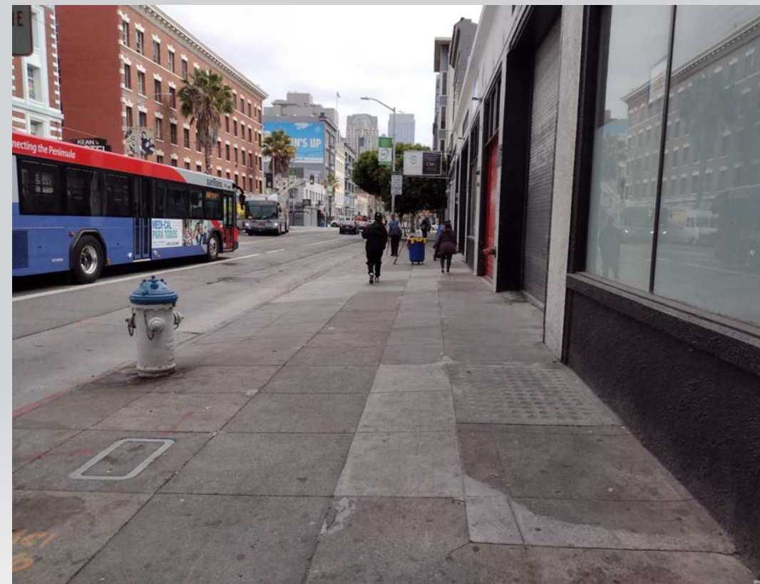
Trash removed – 219 6th Street