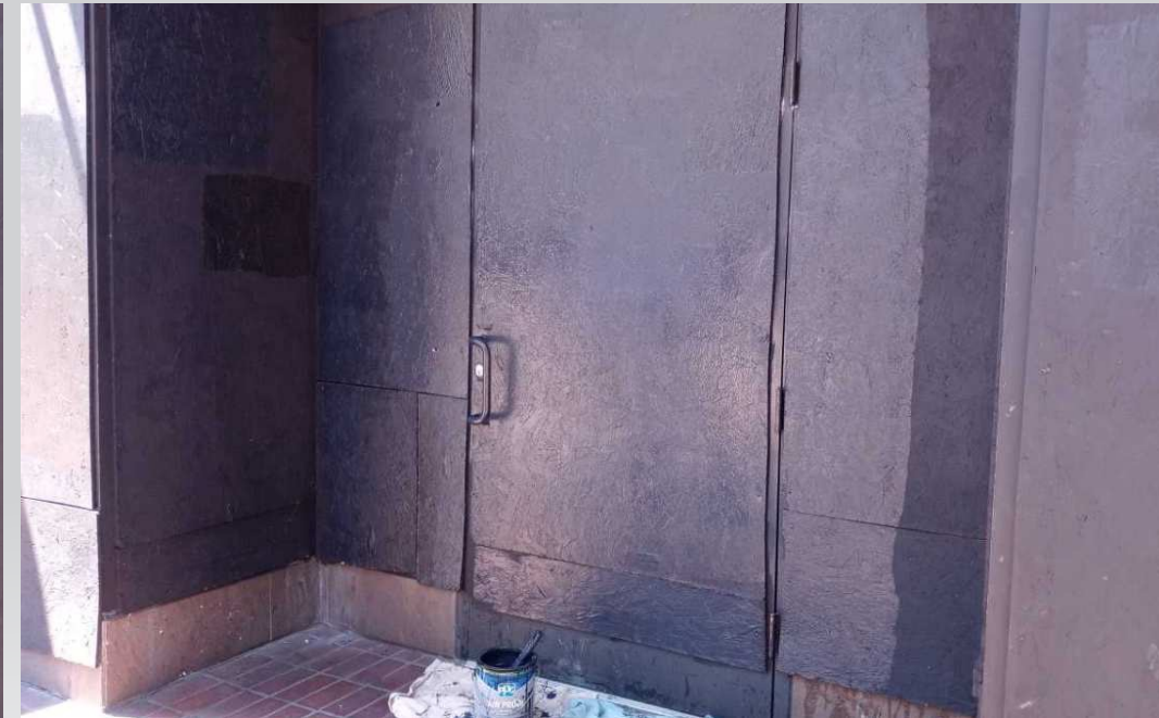
Graffiti removed – 944 Market Street