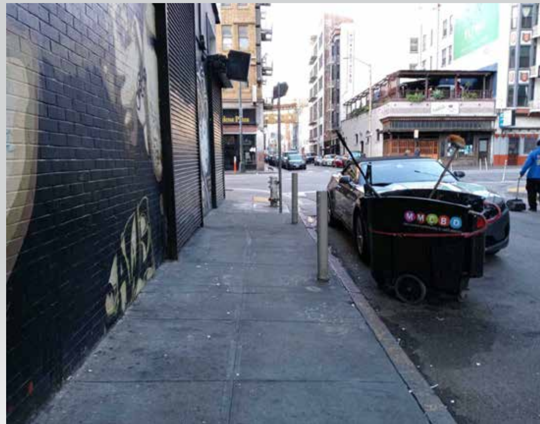
Trash removed – 400-Block of Stevenson Street