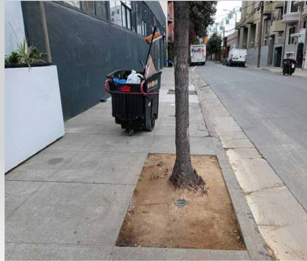
Landscaping – 480 Clementina Street