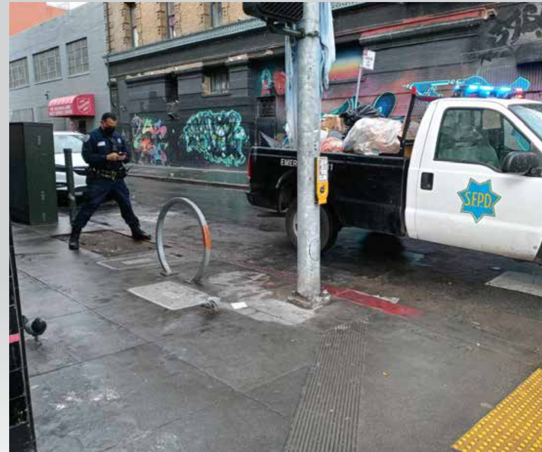
Street trash collected by MMCBD and removed by SFPD – 64 6th Street