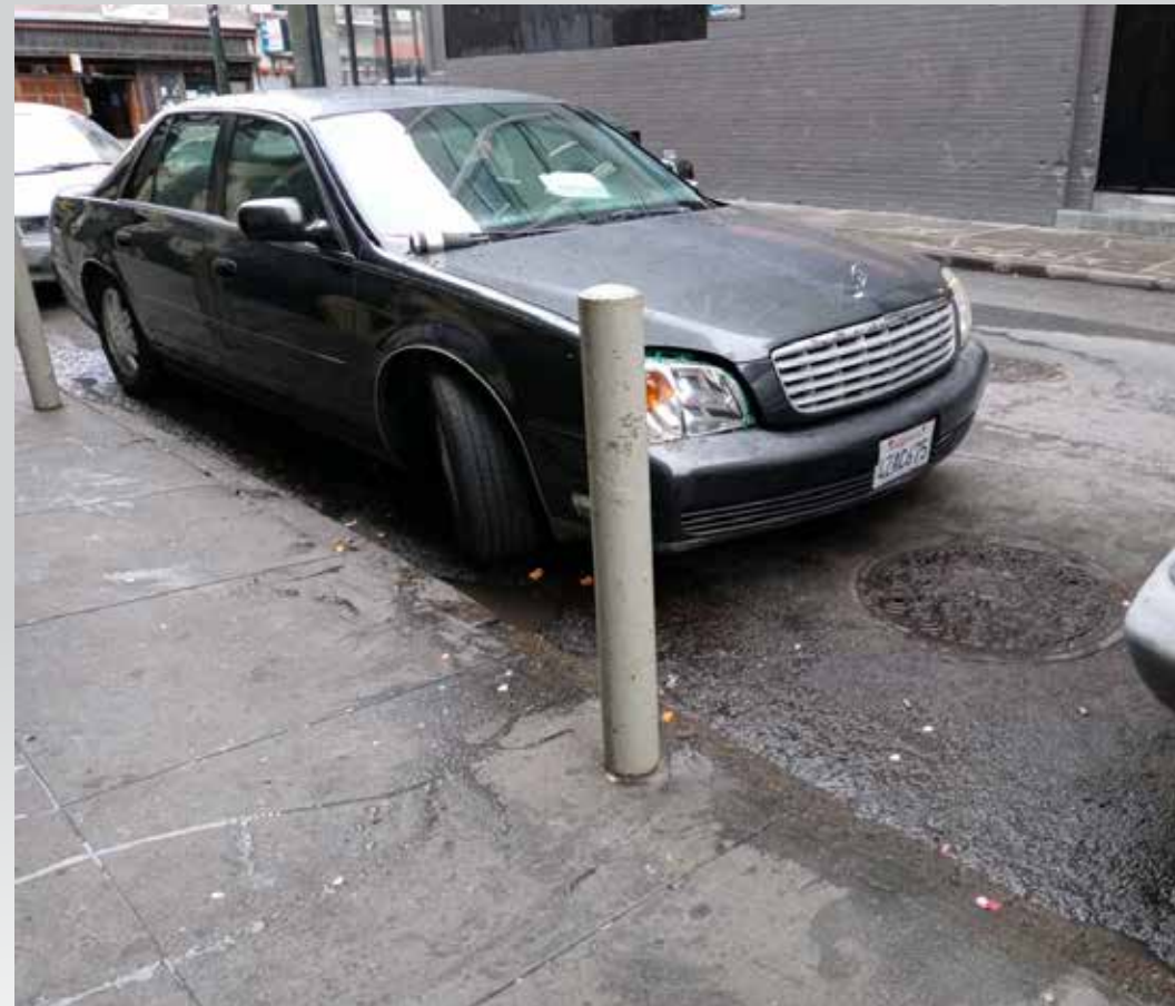
Trash removed – 400-Block of Stevenson Street