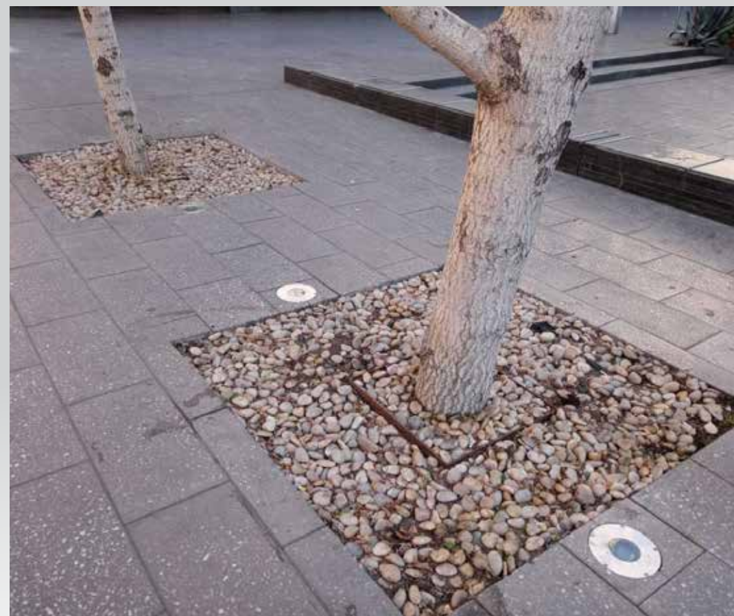
Landscaping – Mint Plaza