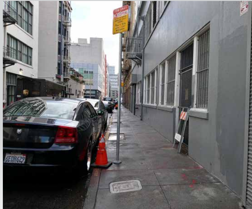
Encampment relocation – 519 Stevenson Street