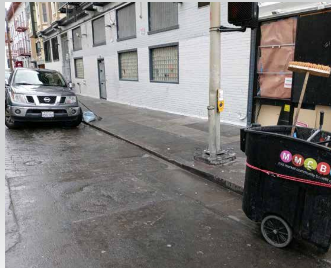
Trash removed – 400-Block of Minna Street