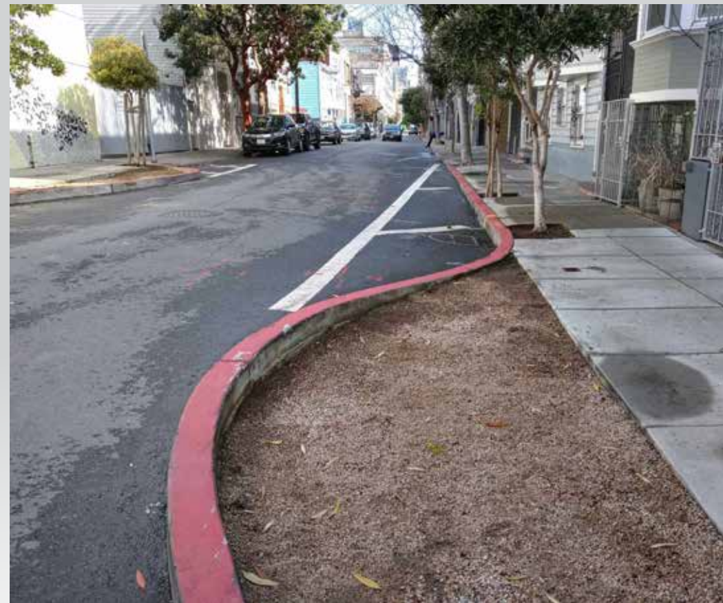
Weeds removed – 453 Tehama Street