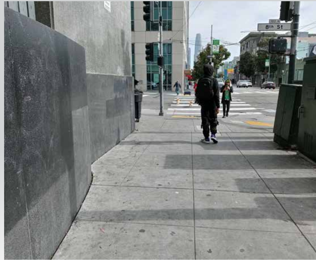
Weeds removed – 1200 Mission Street