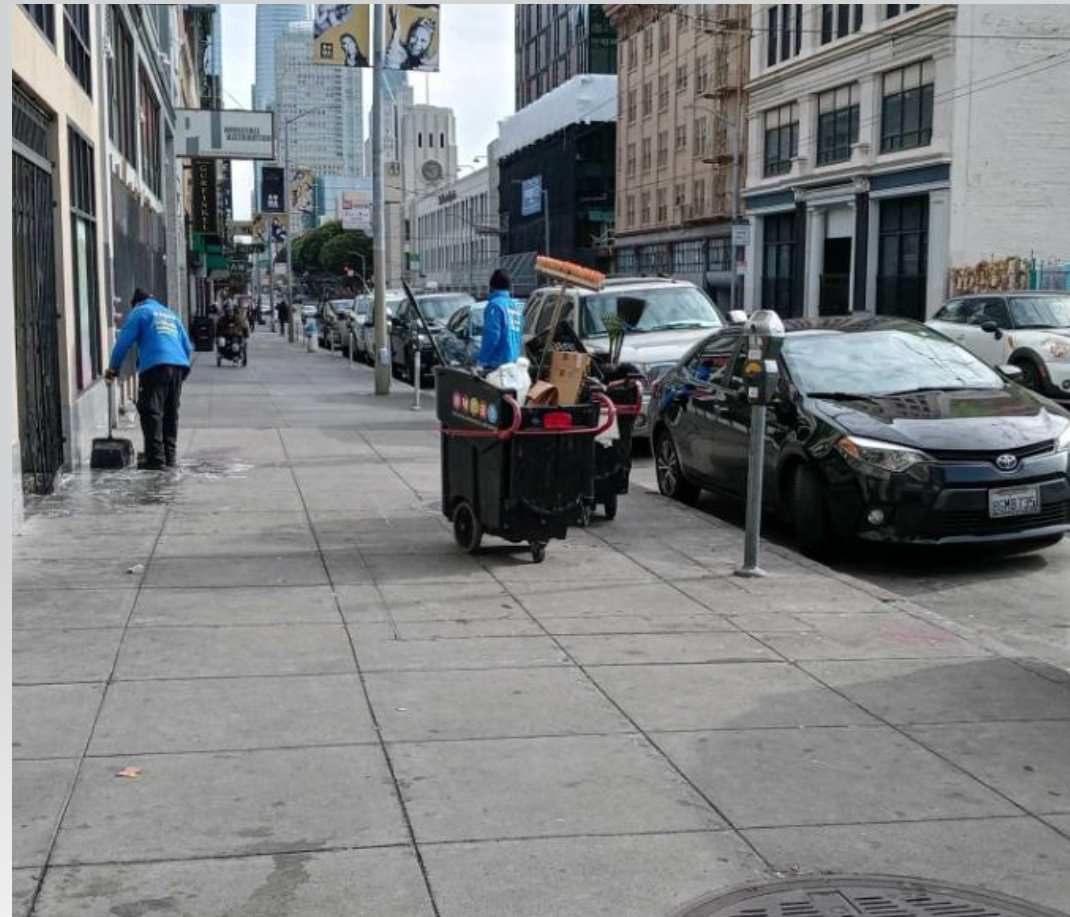
Trash removed – 982 Mission Street