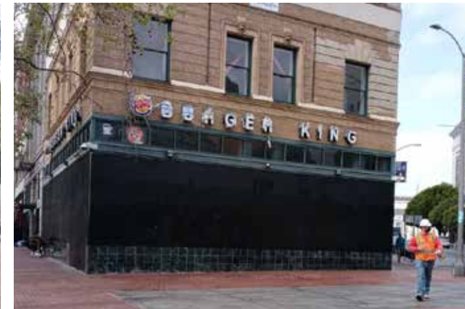
Encampment relocation - 1200 Market Street