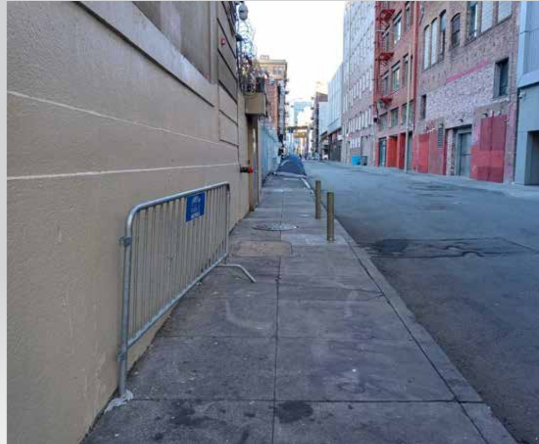
Restored sidewalk accessibility by removing abandoned shelter – 465 Stevenson Street