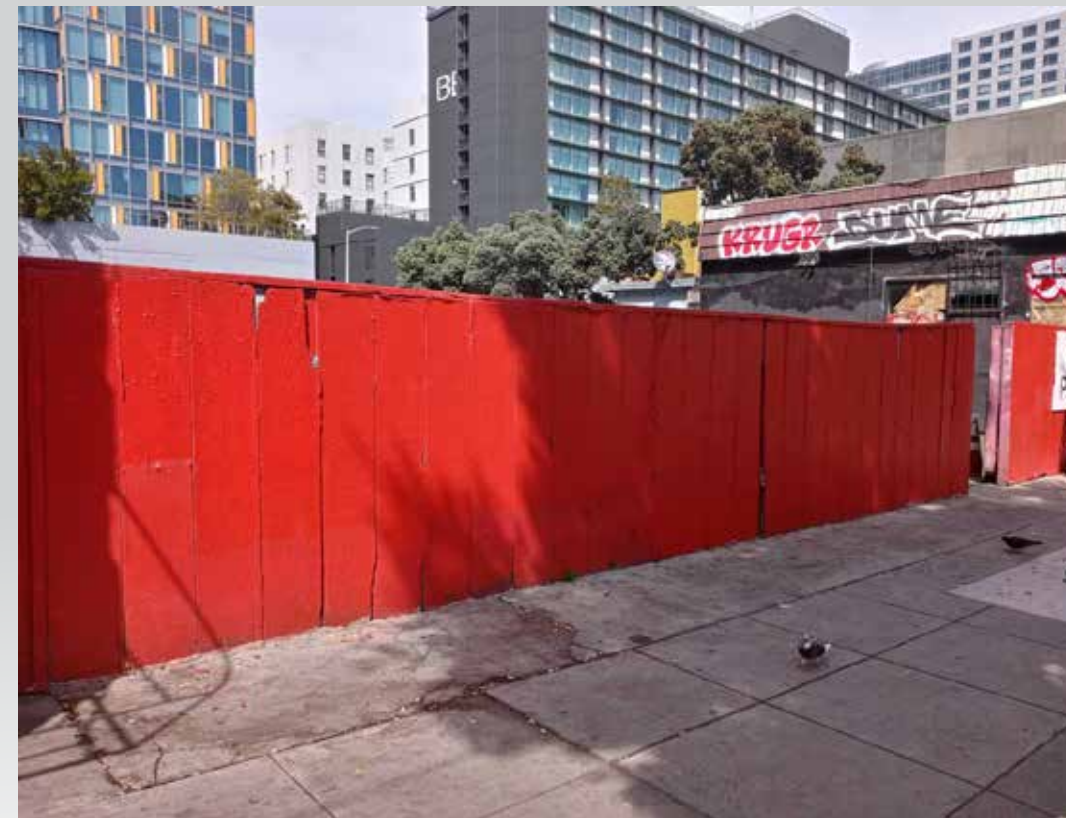
Graffiti removed - 1274 Mission Street