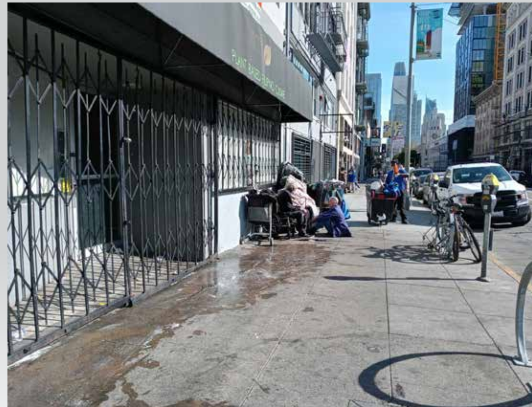
Trash removed – 996 Mission Street