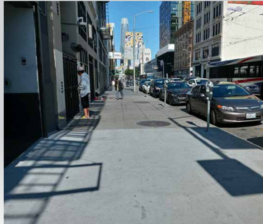
Trash removed – 400-Block of Stevenson Street