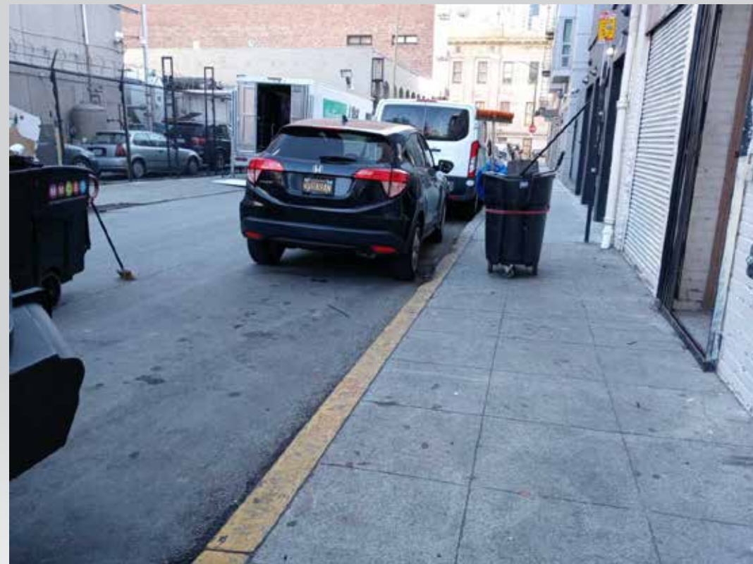
Trash removed – 457 Jesse Street