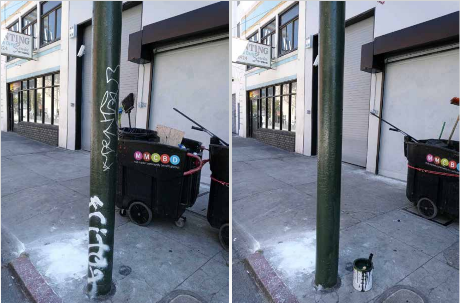
Graffiti removed - 995 Howard Street