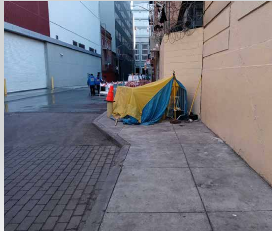
Trash removed – 465 Stevenson Street