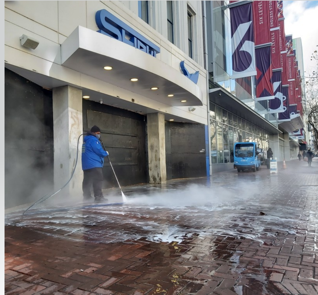
Pressure washing – 929 Market Street