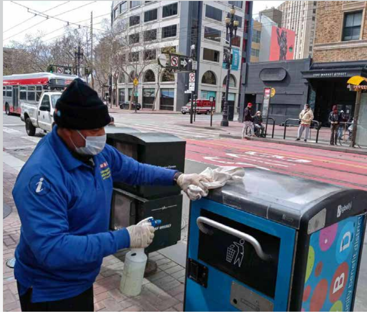
Trash can sanitized – 1095 Mission Street and 1095 Market Street