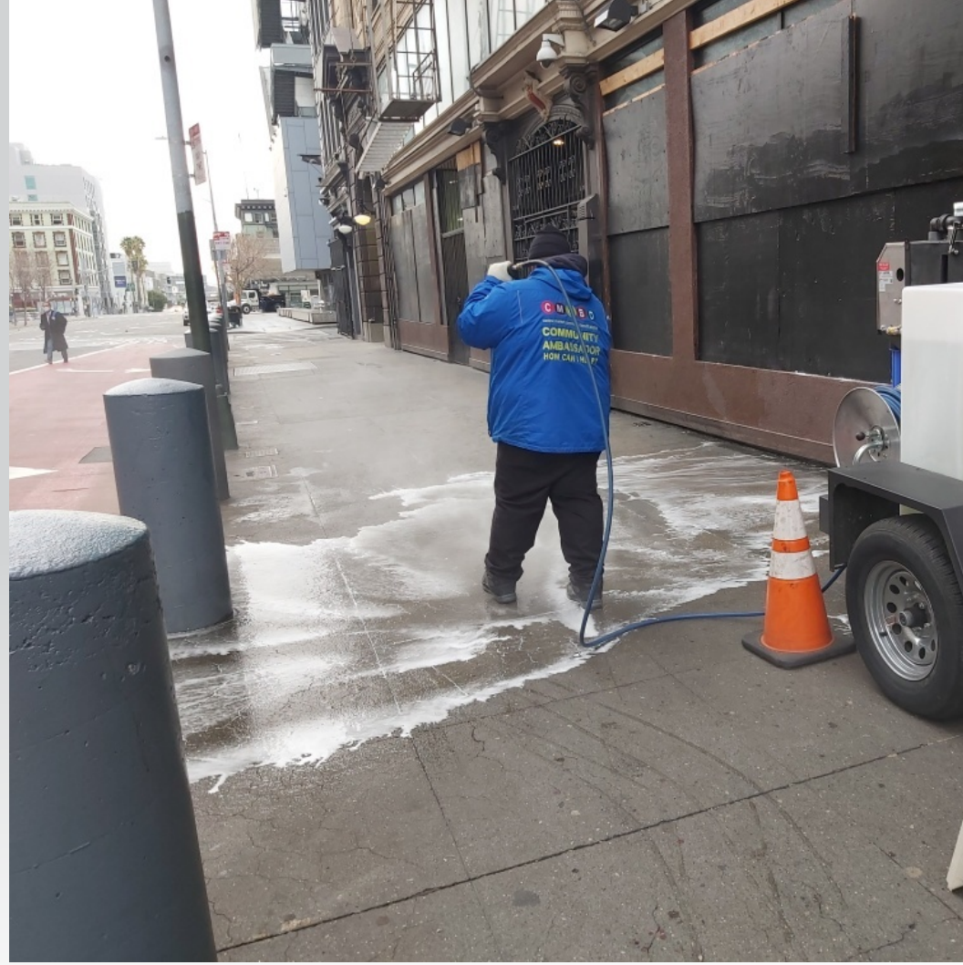
Pressure washing – 26 7th Street