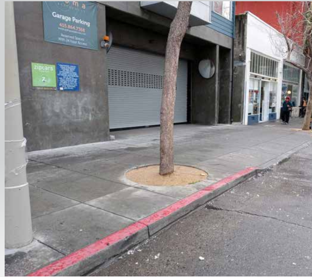
Trash removed – 1077 Mission Street