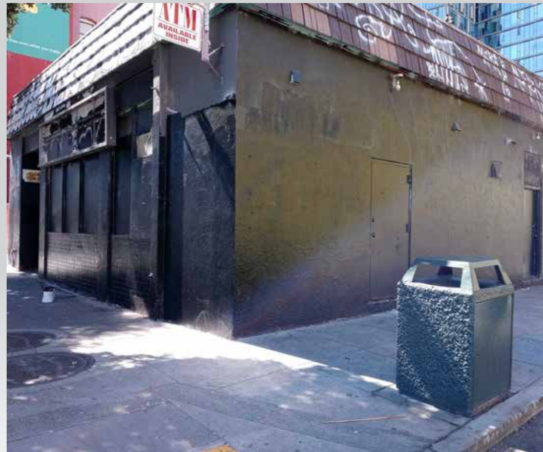
Graffiti removed - 1262 Mission Street