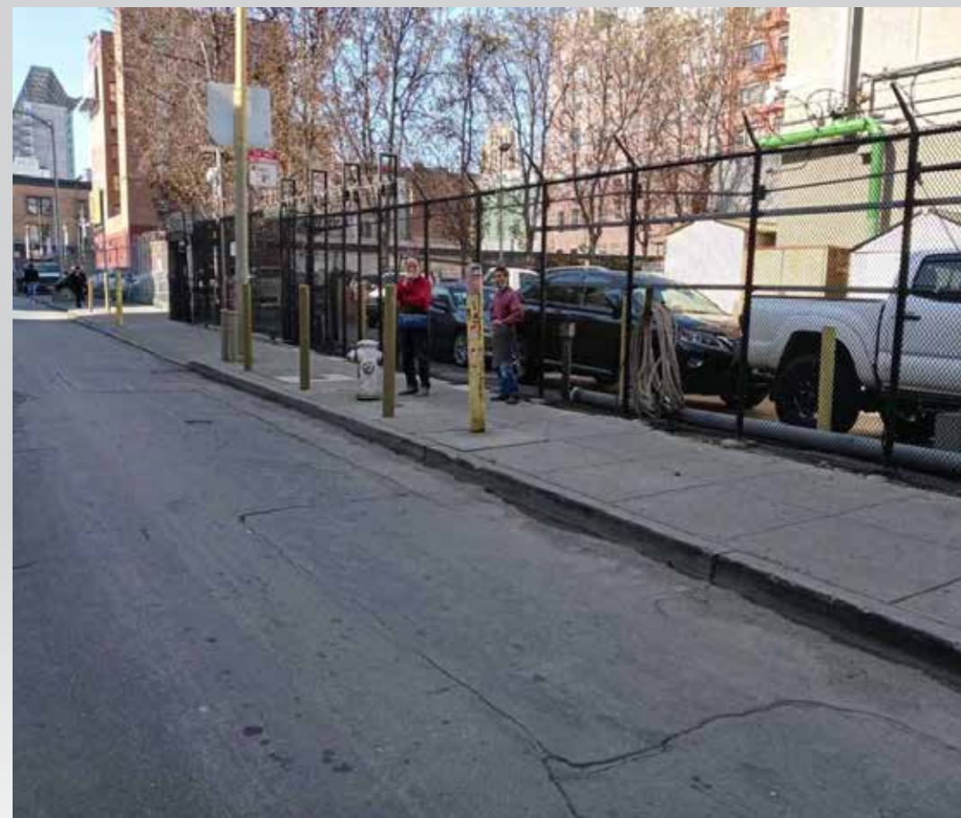
Trash removed – 457 Jesse Street