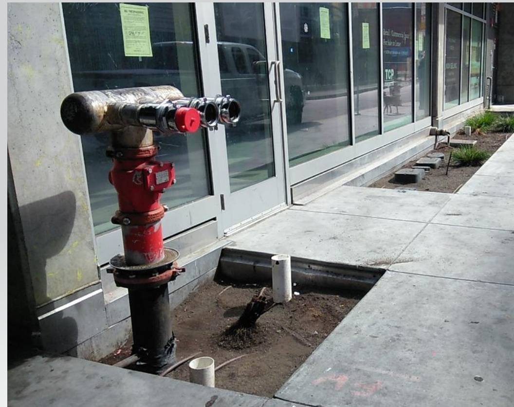
Debris clean up – 580 Stevenson street