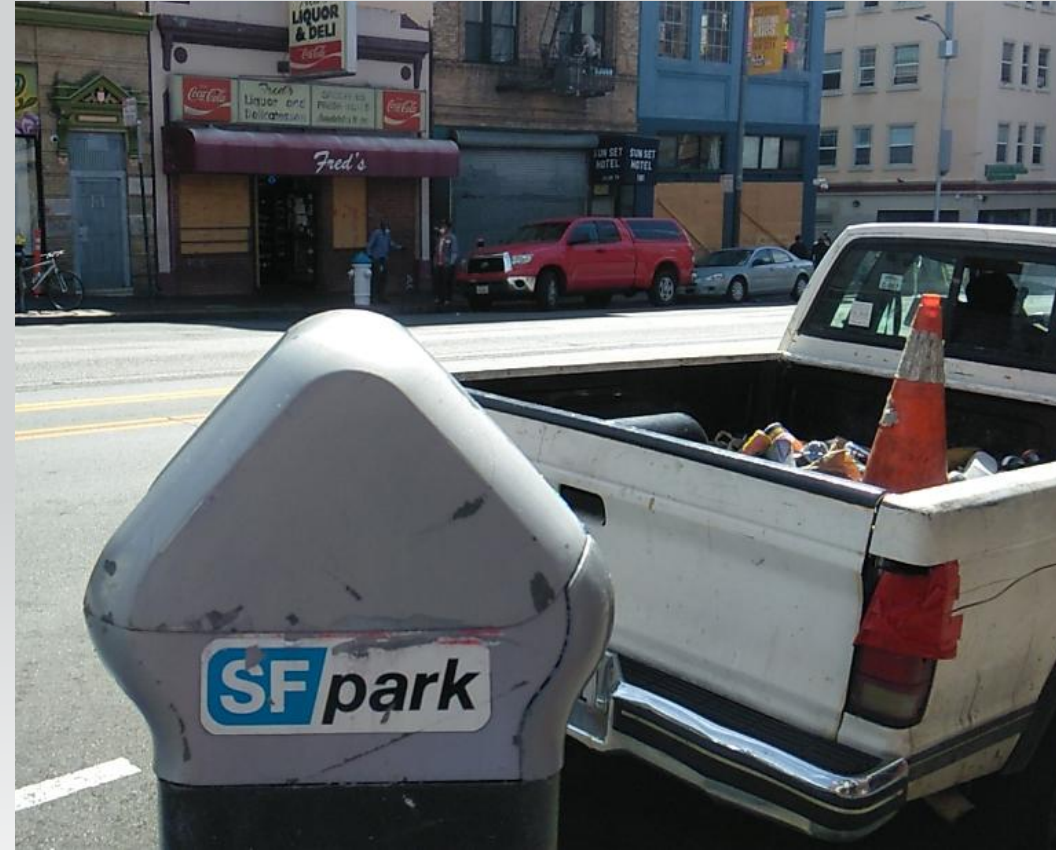
Sticker removal – 138 6th street