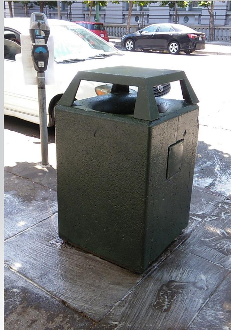
Painting and sanitizing perimeter of city trash can – 1077 Mission Street