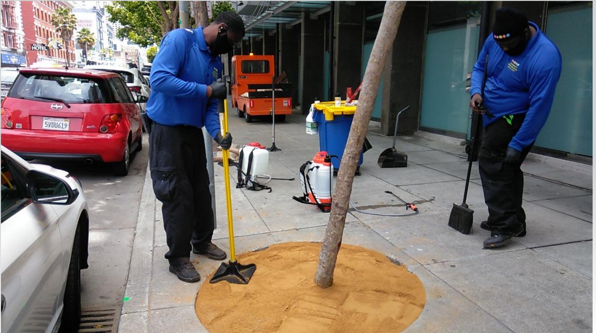
Tree well upkeep – Mission Street (between 6th/7th Street)