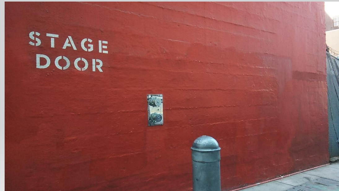
Graffiti Abatement – 644 Stevenson street