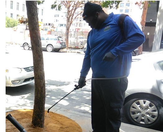
Tree well upkeep – Mission Street (between 6th/7th Street)

Due to social distancing protocols and CDC guidelines , the MM CBD field team focused its operations on cleaning and sanitizing, and safely distributed masks to those in need.