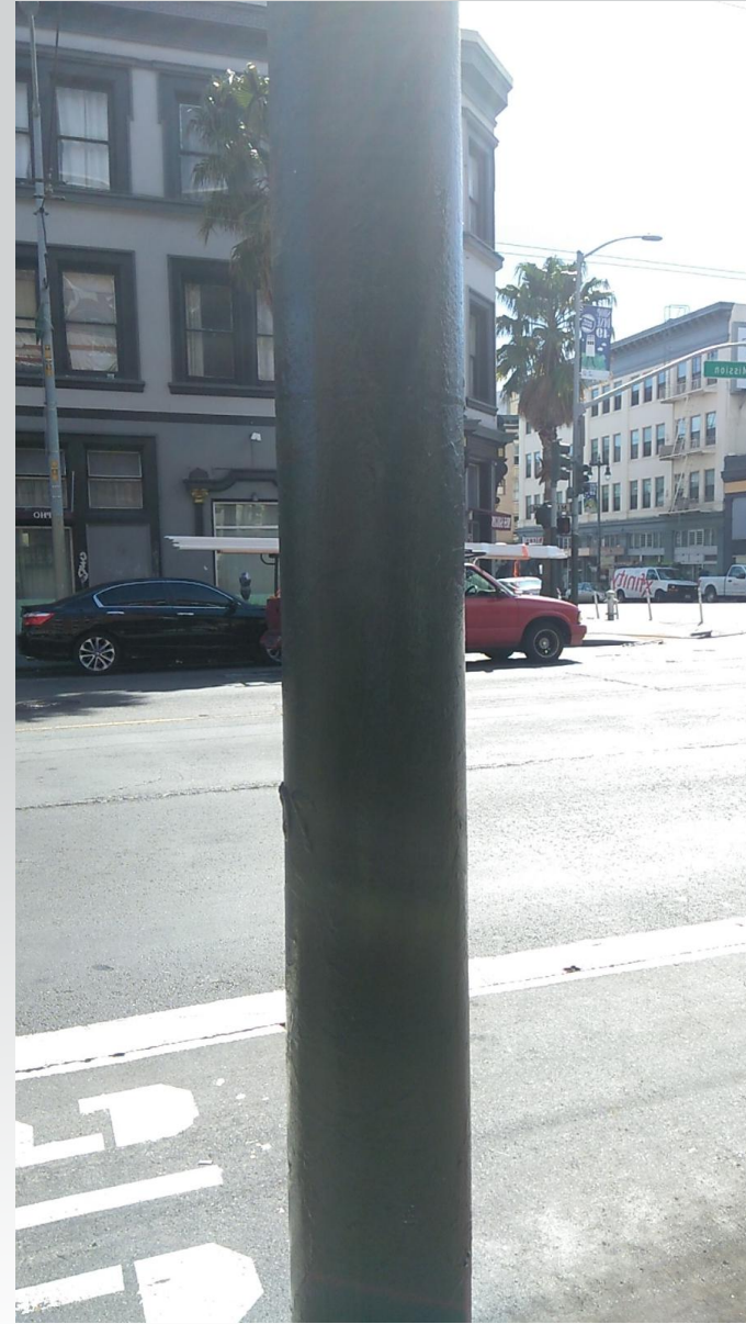
Graffiti Abatement – 88 6th street