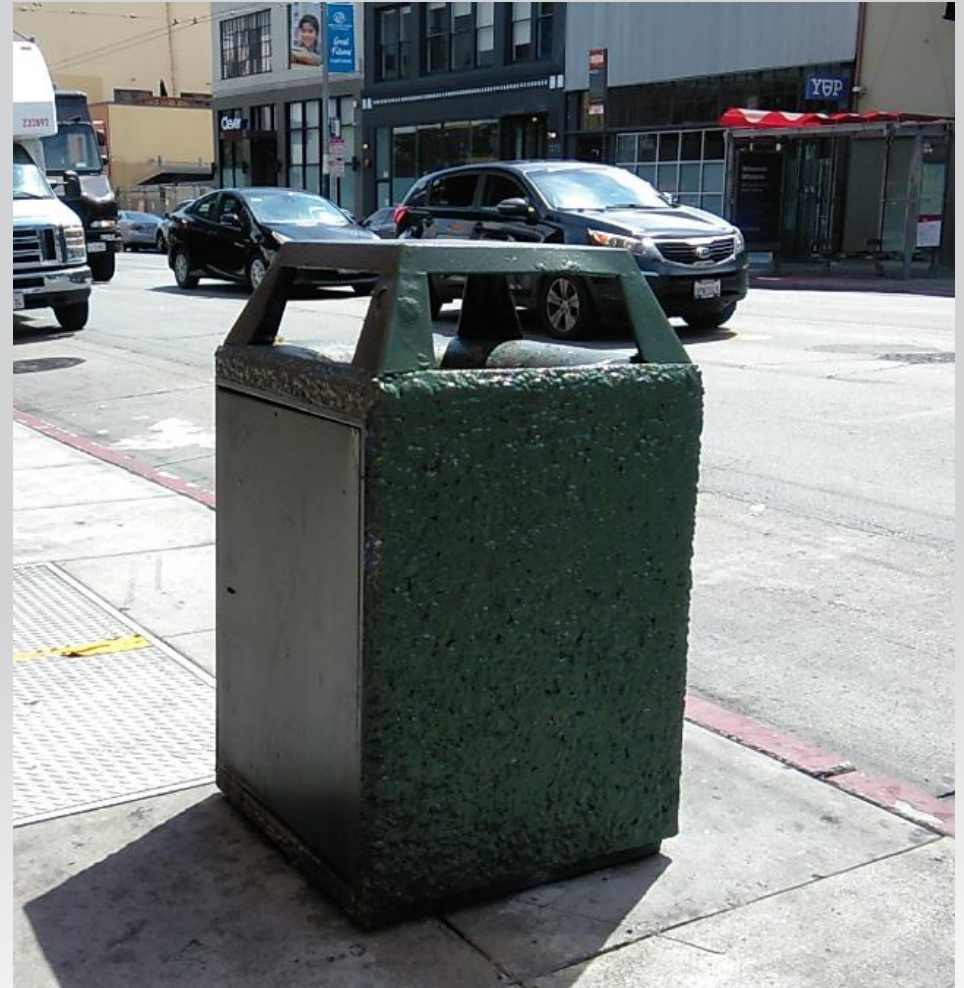
Graffiti abatement on city trash can – 1288 Mission Street