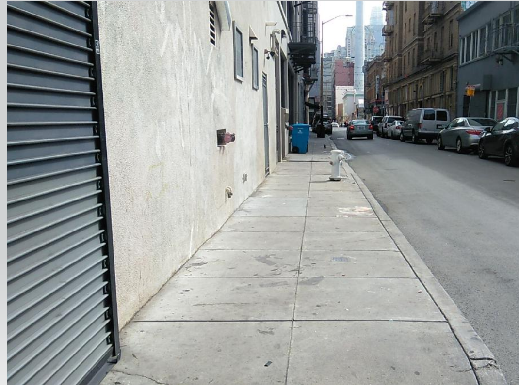
Debris clean up – 529 Stevenson street