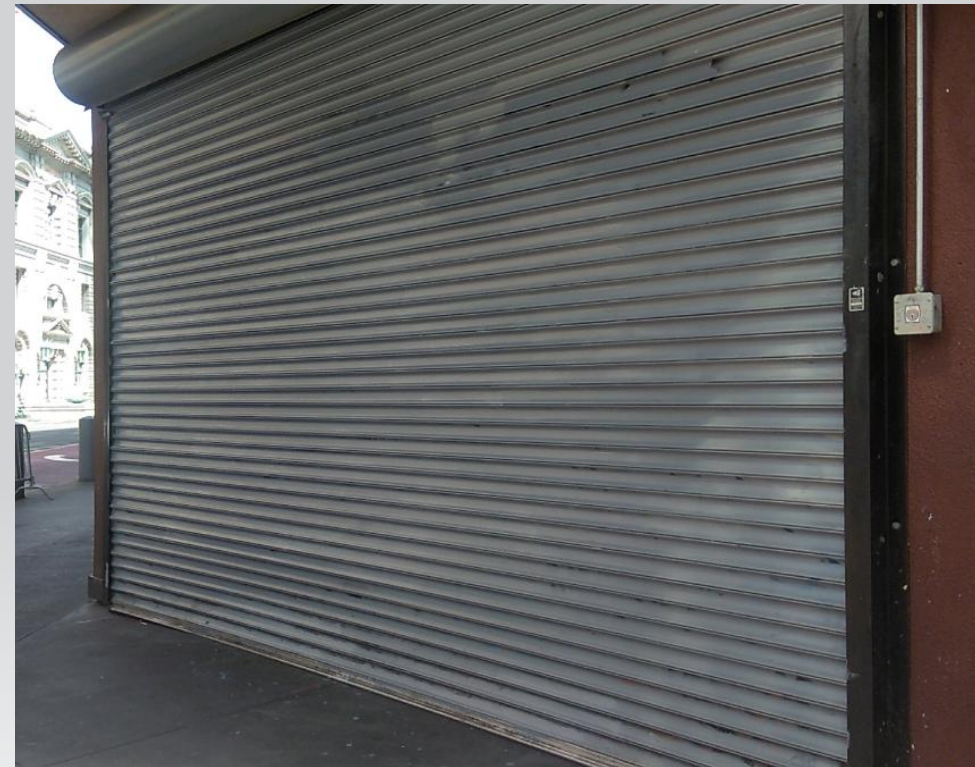
Graffiti Abatement – 1101 Market street