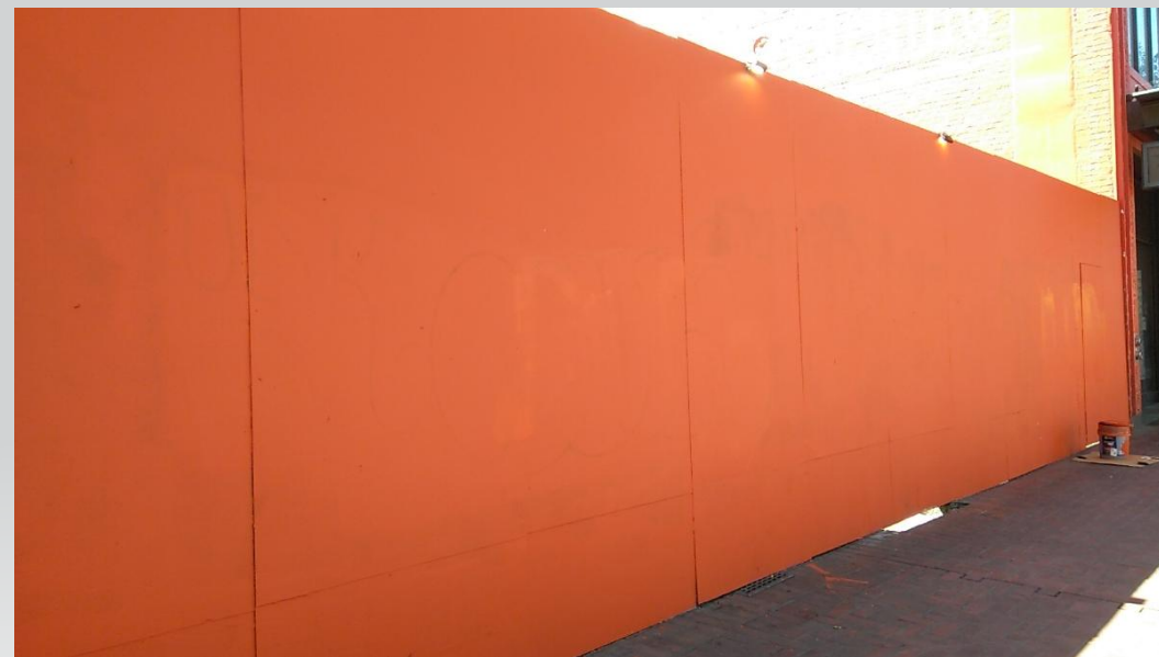
Graffiti abatement – 1127 Market street