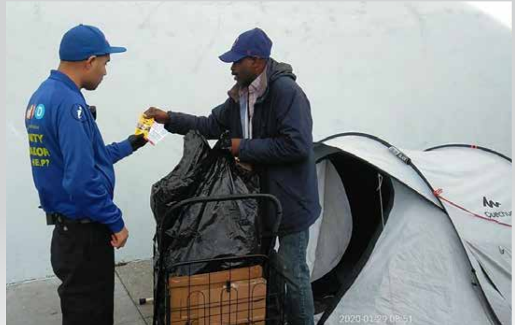
(Left) Ordinance advisement for blocking pedestrian right of way (Right) Service referral provided by Mid Market CBD Ambassador at 498 Clementina Street