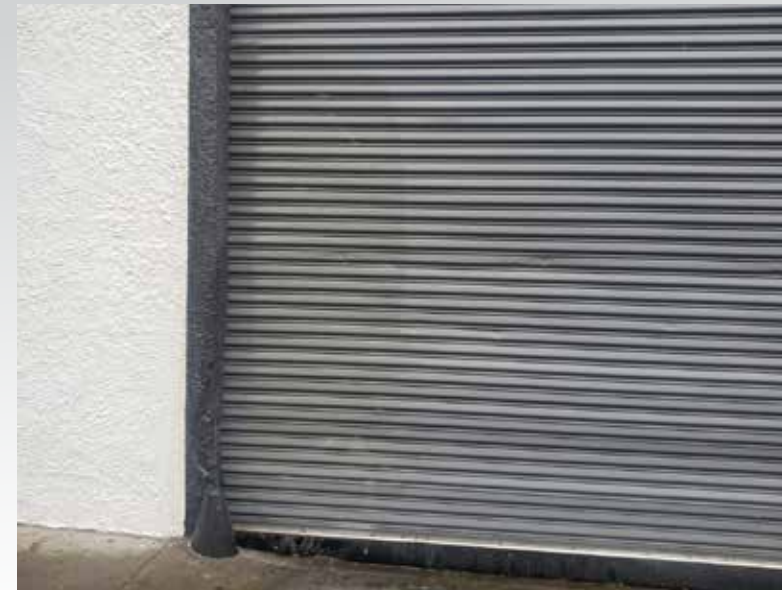
1023 Mission St. Graffiti Abatement