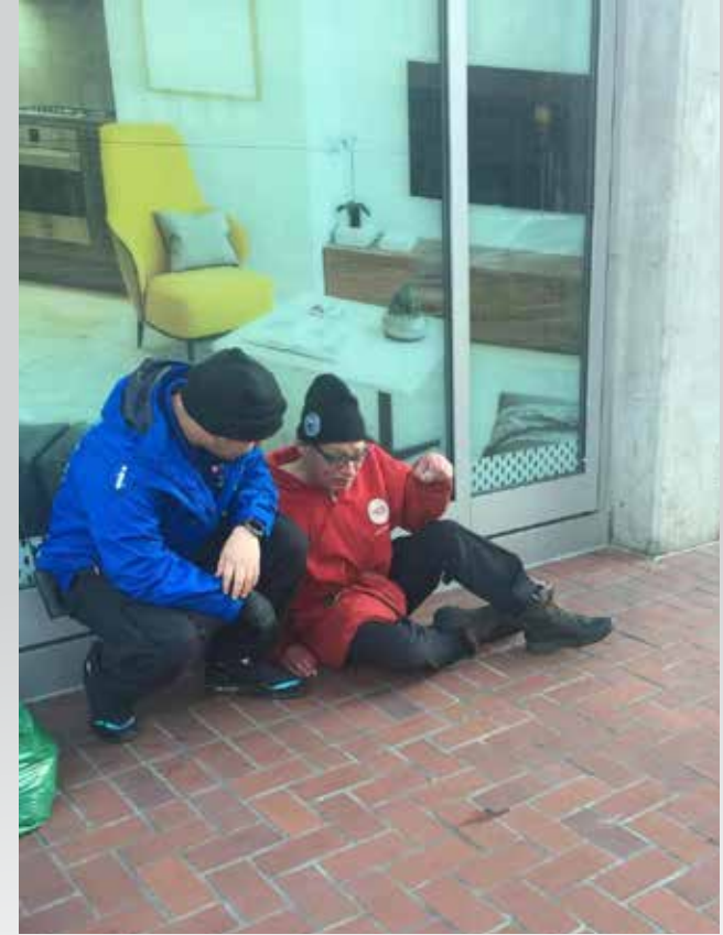
Community Ambassador service referrals given