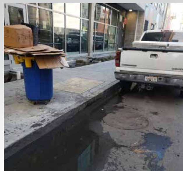
580 Stevenson Cardboard Removal