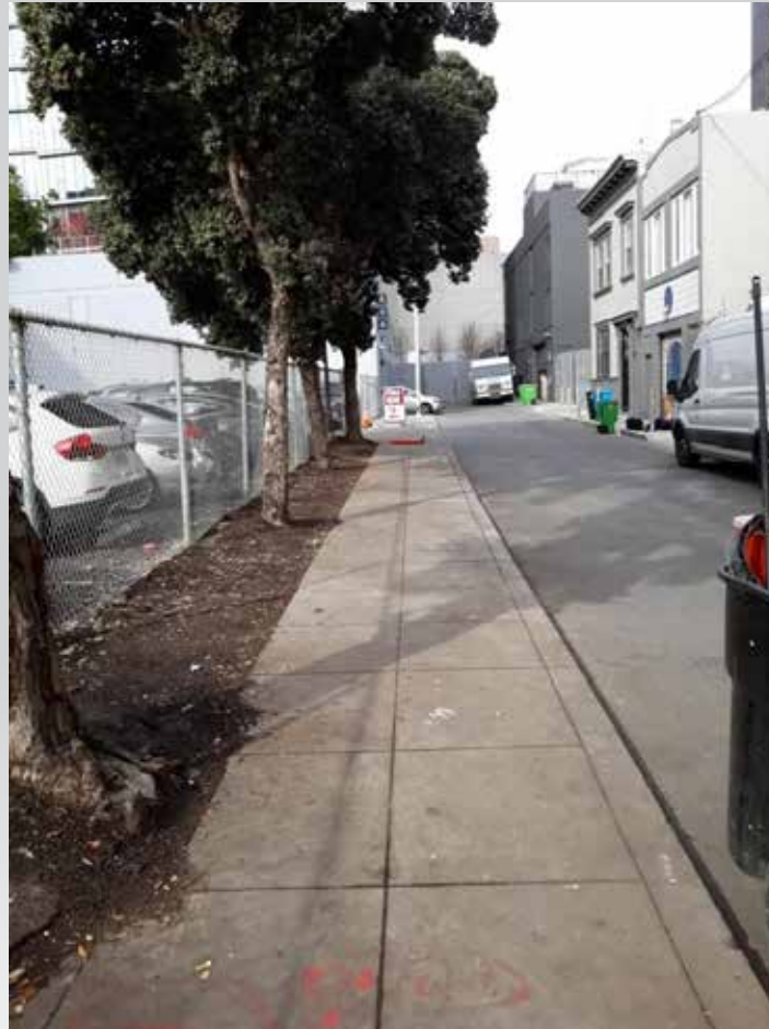
Laskie Alley Debris removal