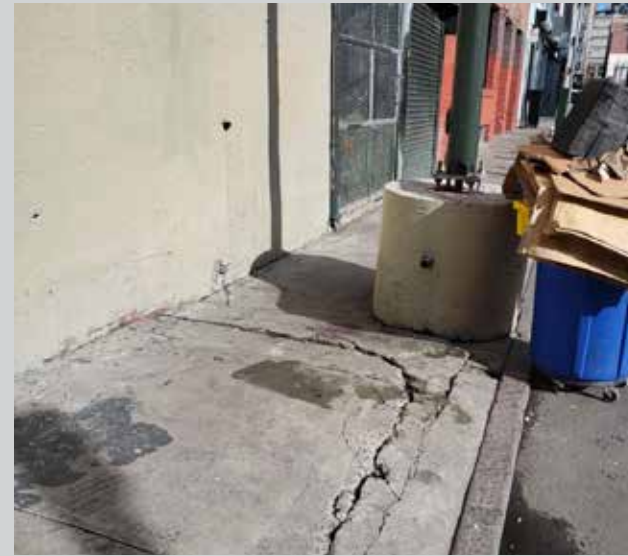
555 Stevenson Cardboard Removal