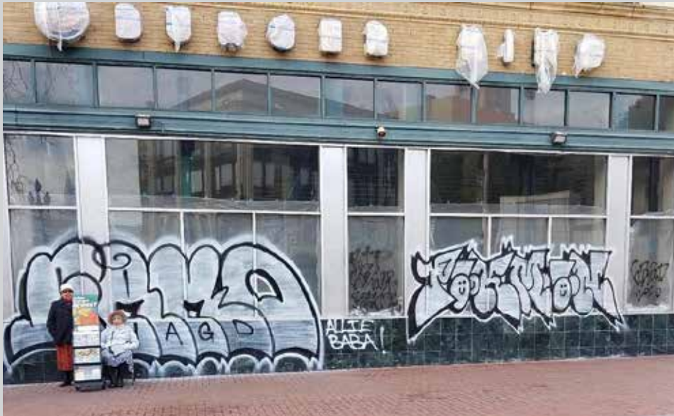
1200 Market Graffiti Abatement