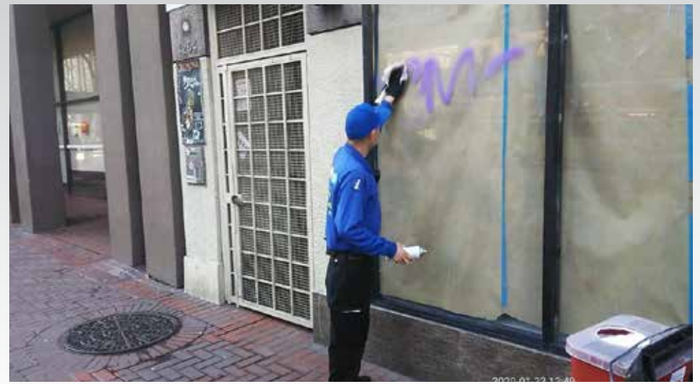
1256 Market St. Graffiti Abatement