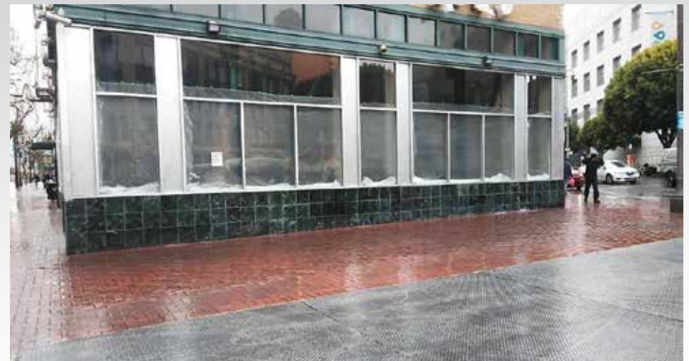
1200 Market St. Graffiti Abatement