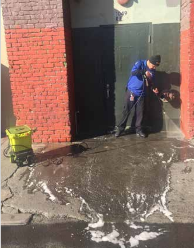
550 Stevenson Pressure Wash