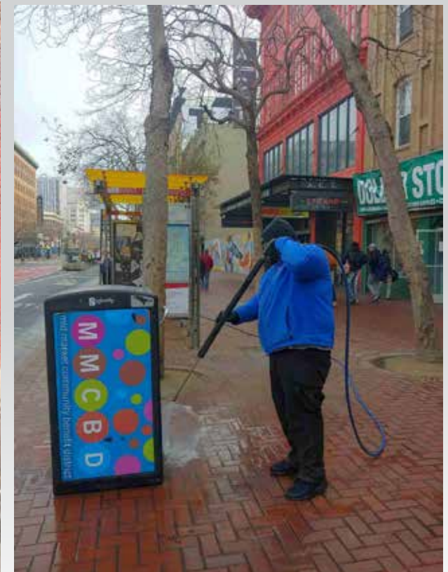
1035 Market Big Belly Pressure Wash