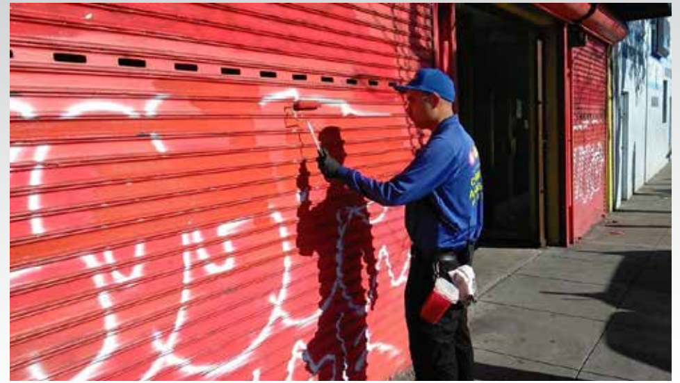
259 6th St. Graffiti Abatement