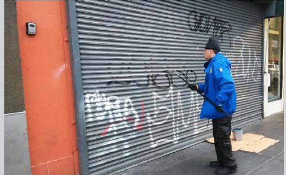
47 6th St. Graffiti Abatement