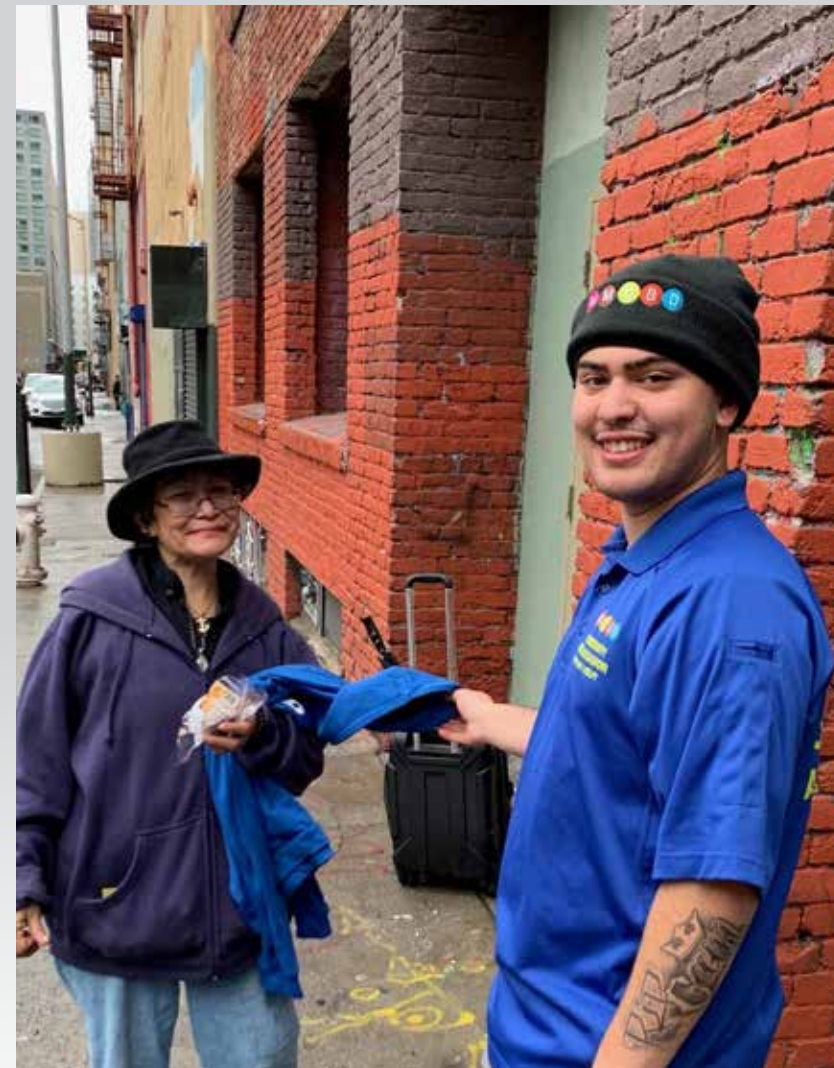
Community Ambassador Clothing Donation