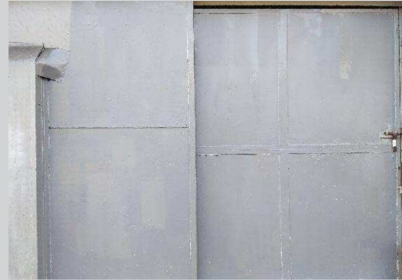
106 6th St. Graffiti Abatement