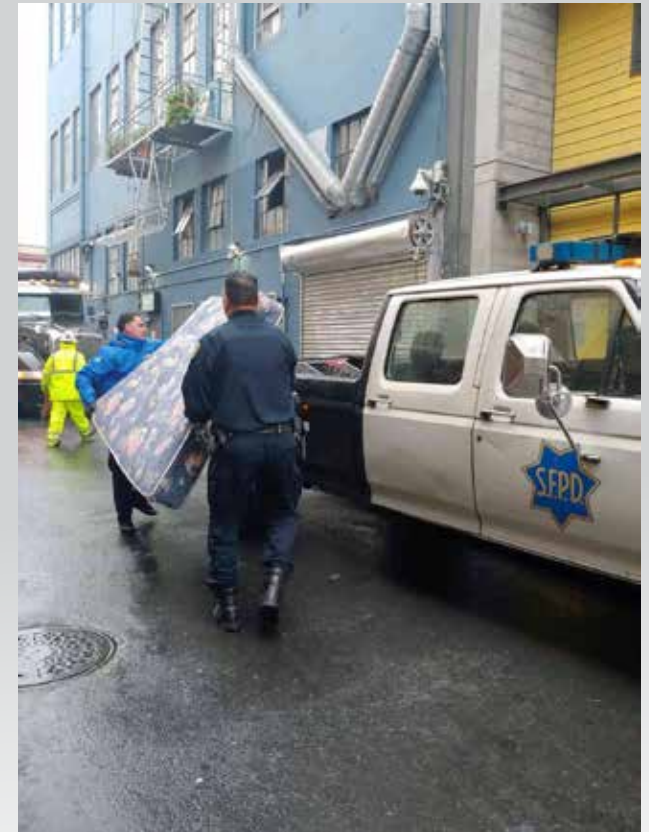
SFPD 10B officer assists Mid Market CBD Ambassadors and janitorial staff remove abandoned property